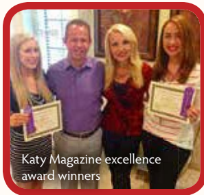
Katy Magazine excellence award winners

Follow us on Instagram @KatyMagazine. Tag us, and you might get regrammed and published here!