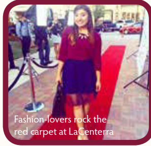
Fashion-lovers rock the red carpet at LaCenterra