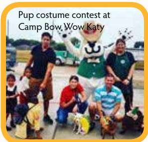
Pup costume contest at Camp Bow Wow Katy