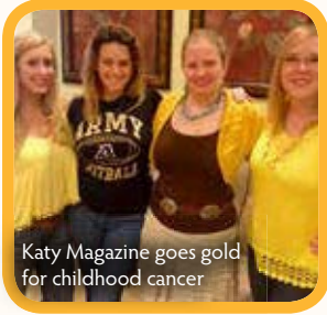
Katy Magazine goes gold for childhood cancer