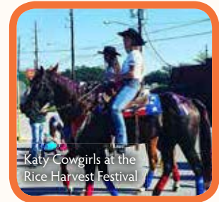
Katy Cowgirls at the Rice Harvest Festival