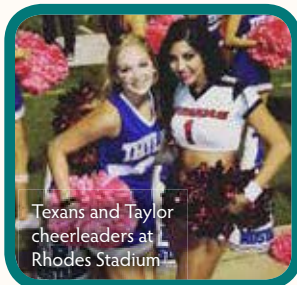
Texans and Taylor cheerleaders at Rhodes Stadium