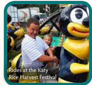
Rides at the Katy Rice Harvest Festival