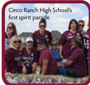
Cinco Ranch High School's first spirit parade