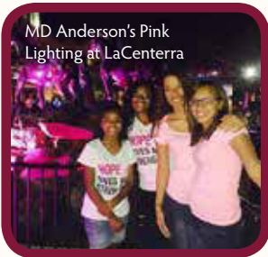
MD Anderson's Pink Lighting at LaCenterra