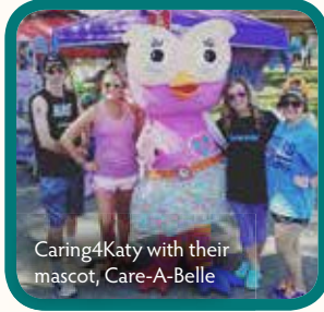
Caring4Katy with their mascot, Care-A-Belle