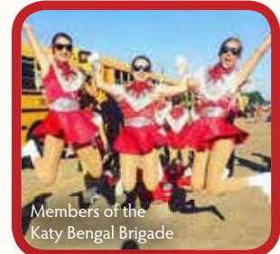
Members of the Katy Bengal Brigade