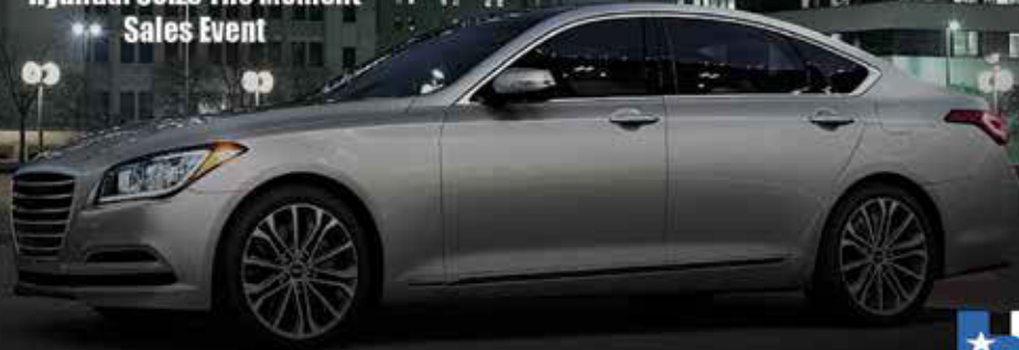
2015 Hyundai Genesis Sedan North American Car of the Year Finalist