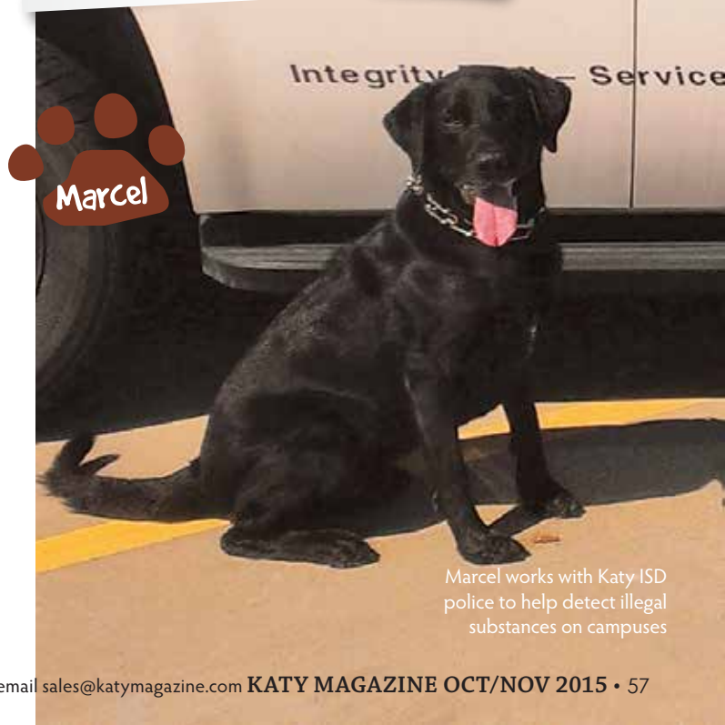
Marcel works with Katy ISD police to help detect illegal substances on campuses