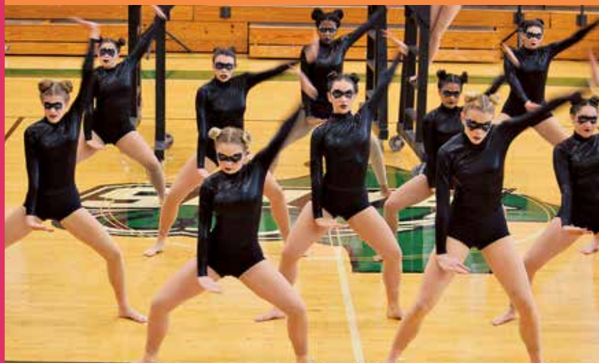
Cinco Ranch High School Orchestra