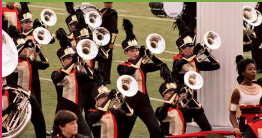
Taylor High School Pacesetters