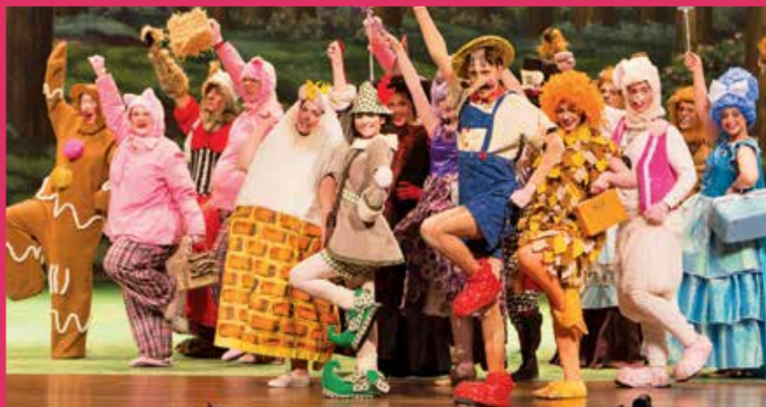
Seven Lakes High School Band