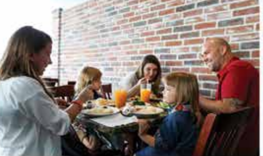
*Kids 12 and under, with purchase of adult entrée, dine-in only, *4-8 pm, limit 2 per family.