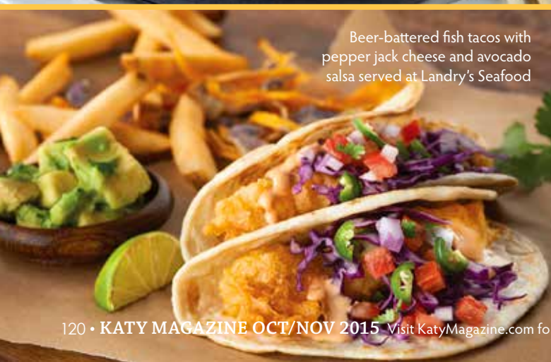
Beer-battered fish tacos with pepper jack cheese and avocado salsa served at Landry's Seafood