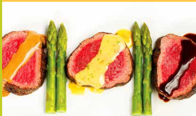
Perry's Steakhouse chateaubriand and asparagus