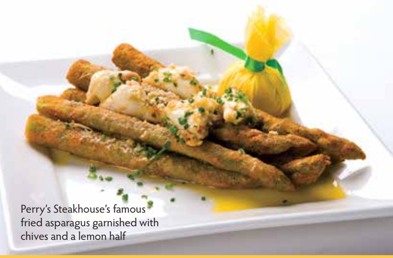
Perry's Steakhouse's famous fried asparagus garnished with chives and a lemon half