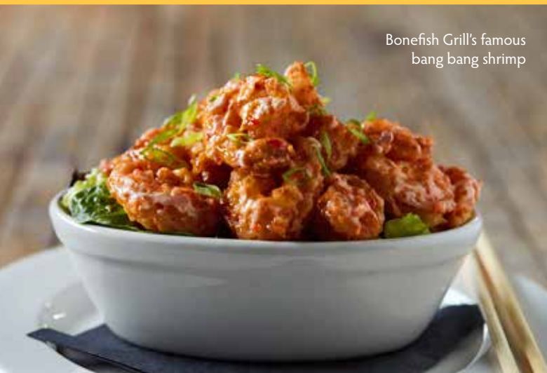
Bonefish Grill's famous bang bang shrimp