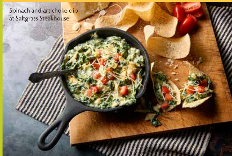
Spinach and artichoke dip at Saltgrass Steakhouse