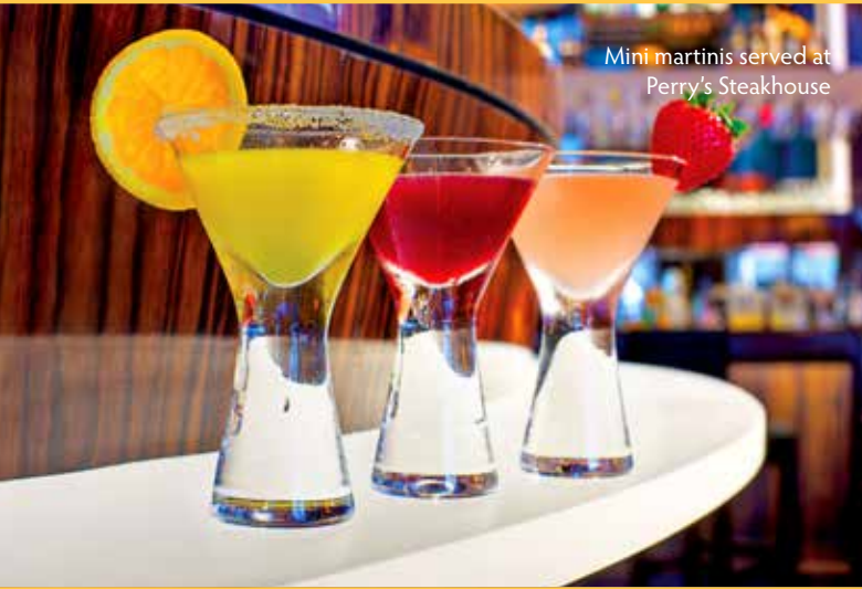
Mini martinis served at Perry's Steakhouse