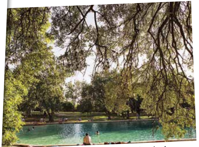
Fort Clark Springs is a historical military fort that has 18 holes of golf, swimming, hiking, and ATV trails