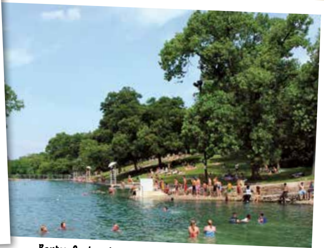
Barton Springs is a popular place to cool off with the family after sightseeing in Austin

Located in Wimberley, which is already well-known as a popular antiques and weekend destination, has another perk to offer families with Blue Hole Regional Park. The swimming area is a naturally-fed spring with a shallow end for little ones. With 126 acres of walking trails and shaded