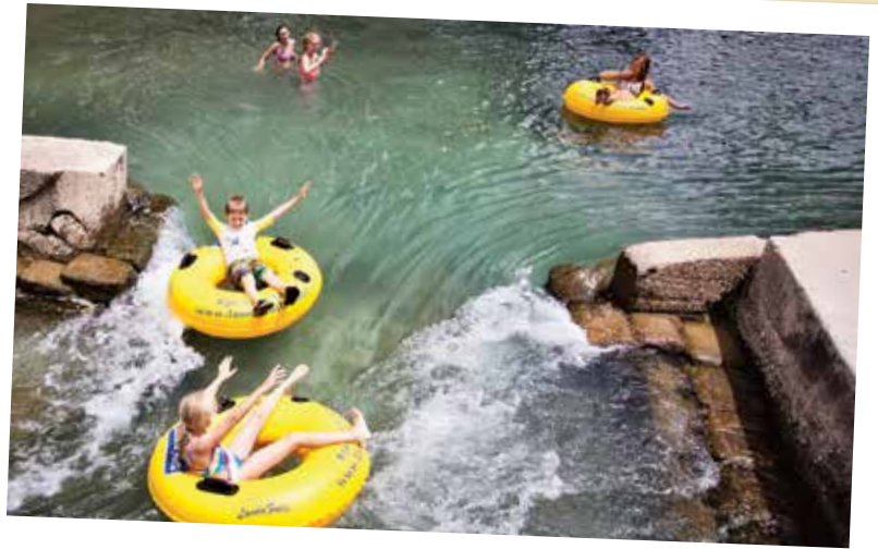
Landa Park in New Braunfels allows easy access to the popular Comal River