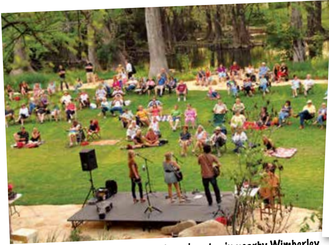
Live music and antique shopping in nearby Wimberley make Blue Hole Regional Park a preferred destination