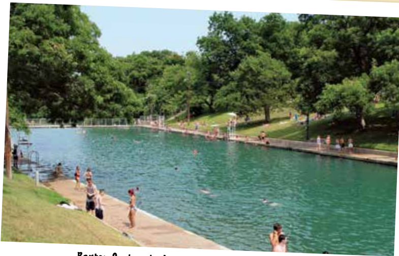
Barton Springs in Austin is a spring-fed swimming hole that stays cool and refreshing year-round