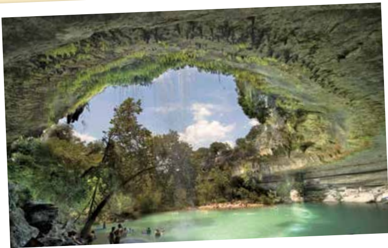
Jewel-bright waters underneath a waterfall at Hamilton Pool Preserve