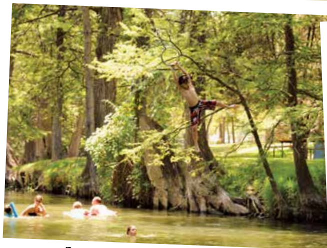
Rope swings provide hours of old-fashioned entertainment at Blue Hole Regional Park

With 80 miles of beautiful shoreline to enjoy, Canyon Lake is located on the Guadalupe River and is one of the deepest lakes in Texas. With multiple parks located in the area, families can hang out, go camping, take part in water sports, catch a fish, or just relax on a beach chair. Fees and hours of operation will vary per park.