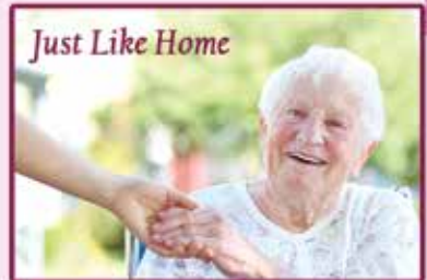
Just Like Home