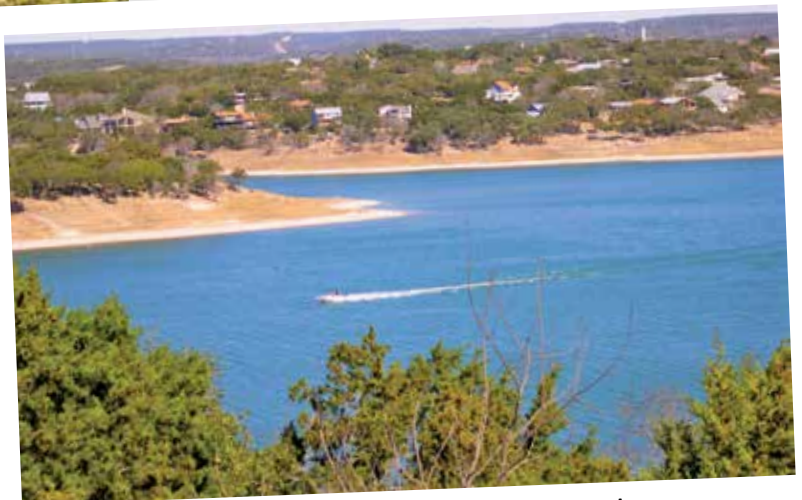
Water enthusiasts spend hours boating, swimming, and fishing at Canyon Lake near San Antonio