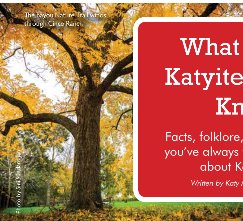
The Bayou Nature Trail winds through Cinco Ranch