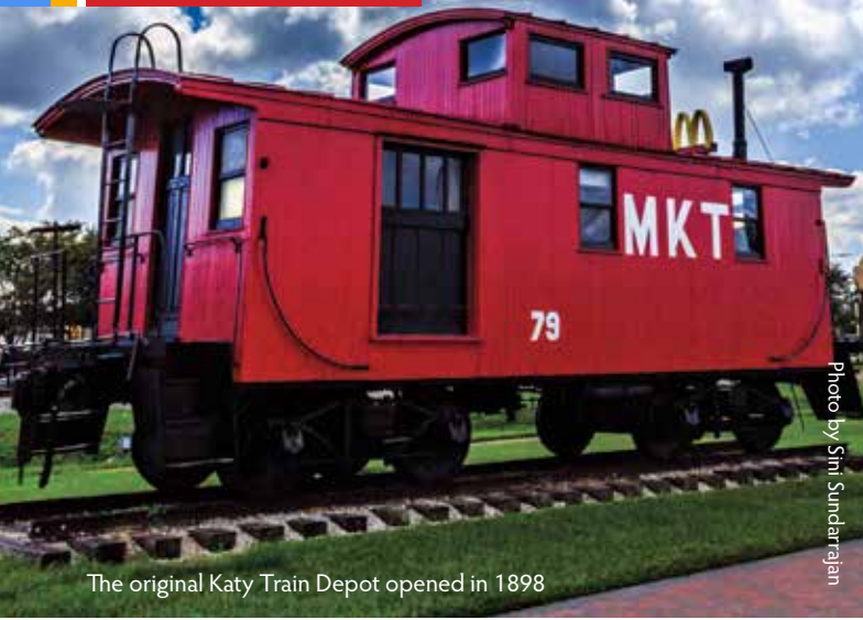
The original Katy Train Depot opened in 1898