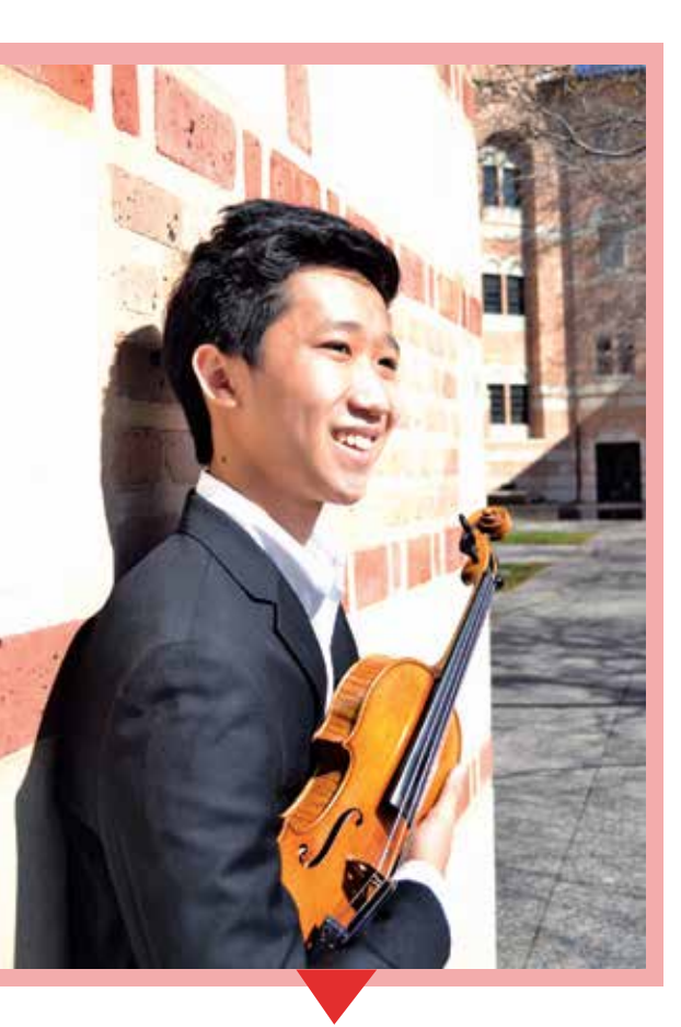
Cinco Ranch High School