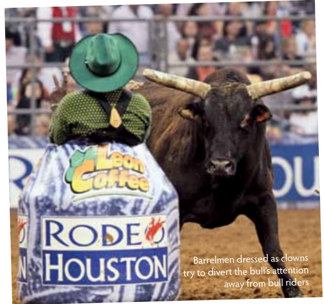
Barrelmen dressed as clowns try to divert the bull's attention away from bull riders

Since the beginning of the rodeo, the organization has been paying it forward. "The [association] has committed nearly $375 million to supporting the youth of Texas and agriculture," Poole says. The rodeo has also provided educational scholarships for students within the area. For the upcoming 2015 year, over $24 million will be dedicated to "educational program grants, scholarships, graduate assistantships, and junior show exhibitors, and calf scramble participants." KM