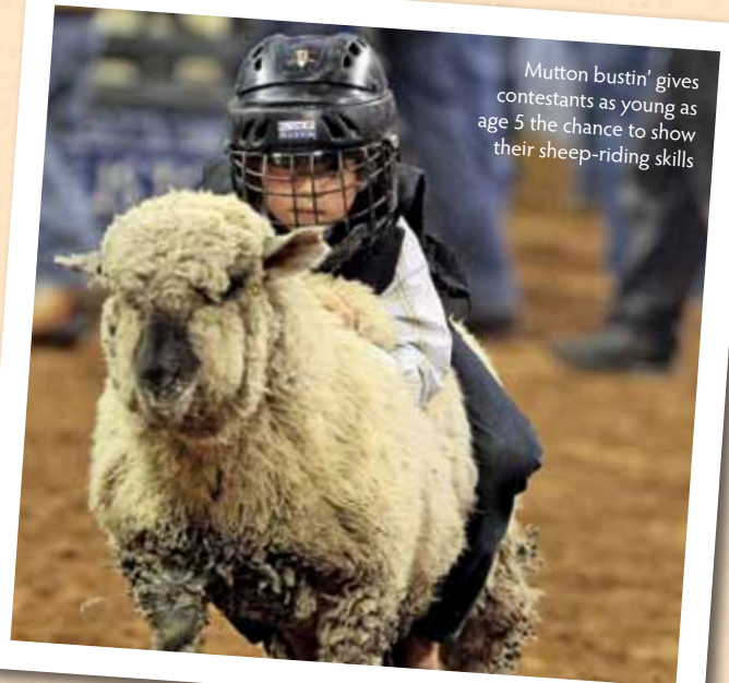
Mutton bustin' gives contestants as young as age 5 the chance to show their sheep-riding skills