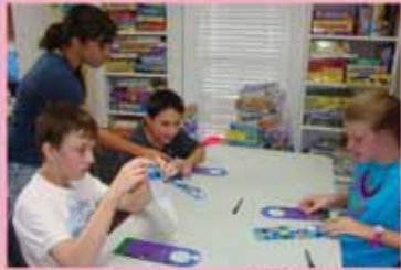
Premier Academy 8:30-3:30

Highly acclaimed therapy programs for children with special needs.