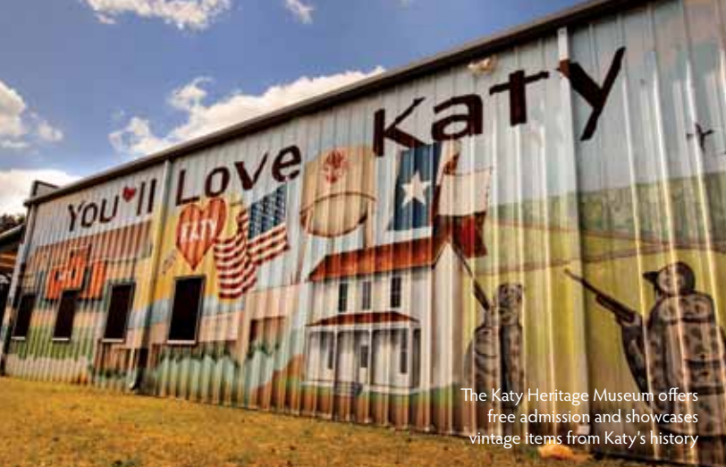
The Katy Heritage Museum offers free admission and showcases vintage items from Katy's history