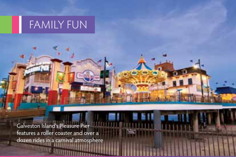
Galveston Island's Pleasure Pier features a roller coaster and over a dozen rides in a carnival atmosphere