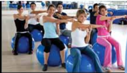
Semi-Private Small Group