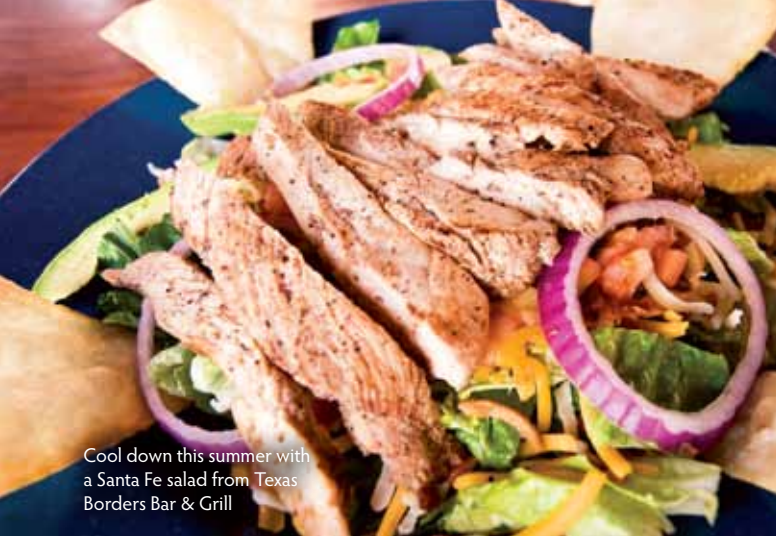
Cool down this summer with a Santa Fe salad from Texas Borders Bar & Grill