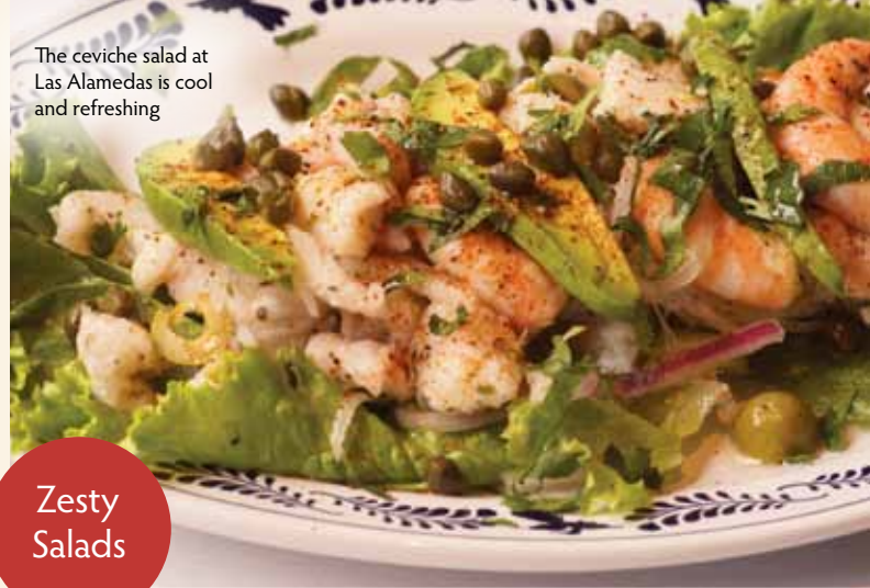
The ceviche salad at Las Alamedas is cool and refreshing

2450 Fry Rd. 281-578-7770 www.katybooks.com