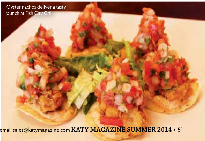
Oyster nachos deliver a tasty punch at Fish City Grill