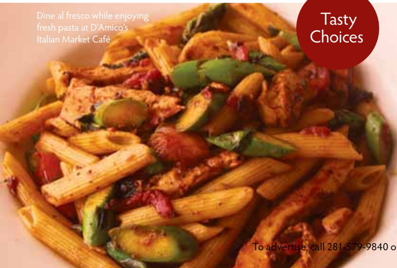
Dine al fresco while enjoying fresh pasta at D'Amico's Italian Market Café