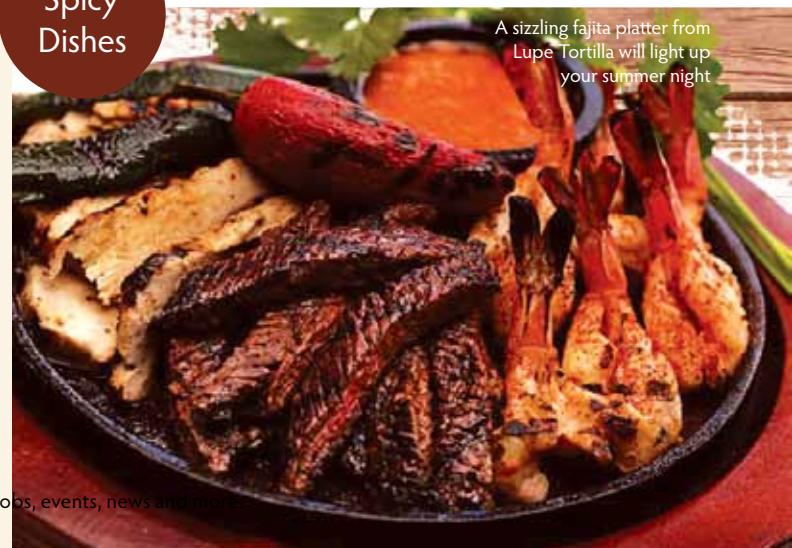
A sizzling fajita platter from Lupe Tortilla will light up your summer night

Privileges at Memorial Hermann Katy Hospital & Methodist West Houston Hospital