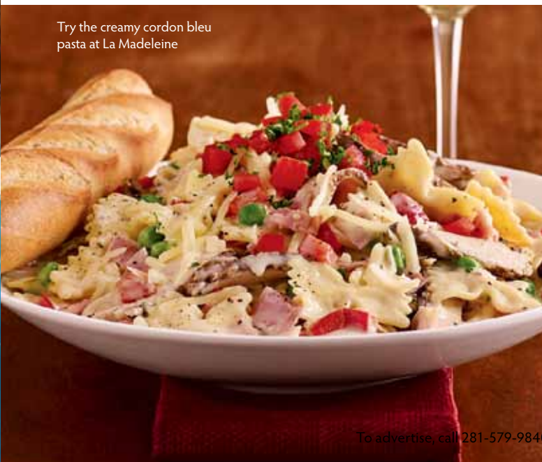
Try the creamy cordon bleu pasta at La Madeleine