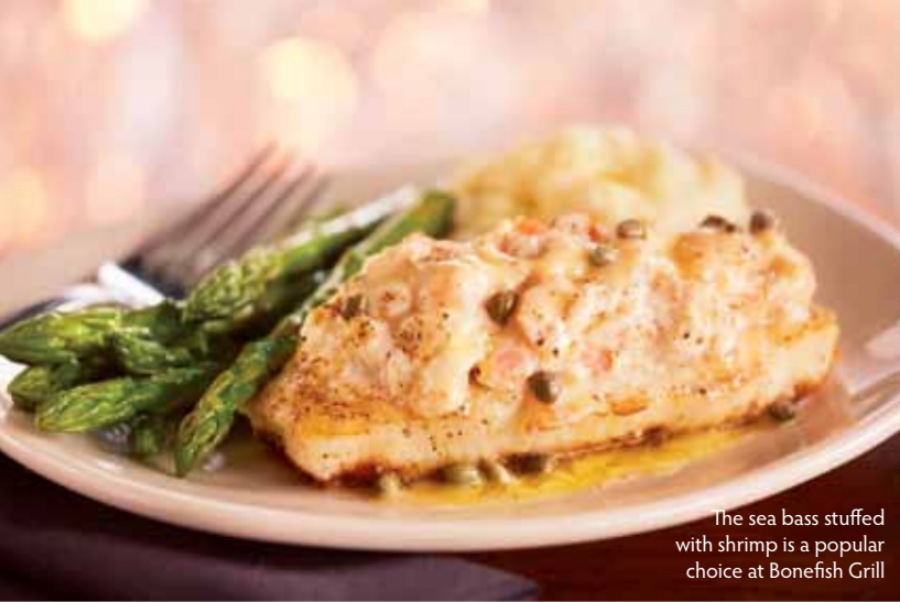
The sea bass stuffed with shrimp is a popular choice at Bonefish Grill