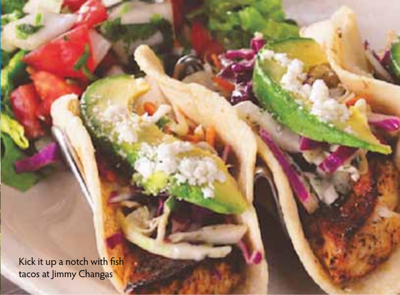
Kick it up a notch with fish tacos at Jimmy Changas