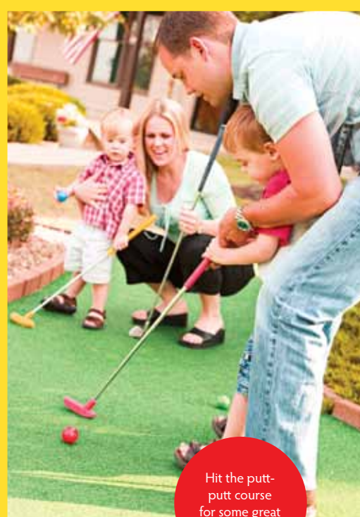
Hit the putt-putt course for some great family fun