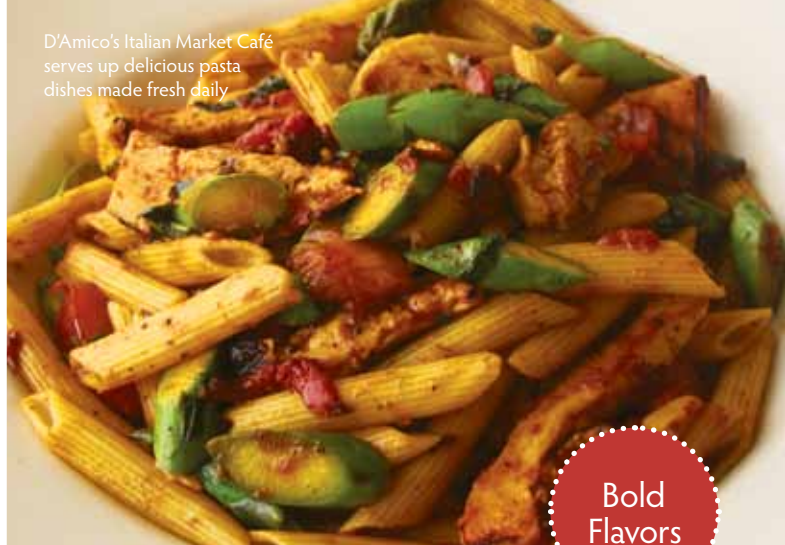
D'Amico's Italian Market Café serves up delicious pasta dishes made fresh daily