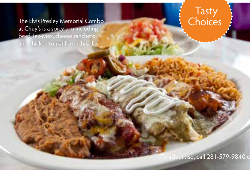
The Elvis Presley Memorial Combo at Chuy's is a spicy trio including beef Tex-Mex, cheese ranchero, and chicken tomatillo enchiladas