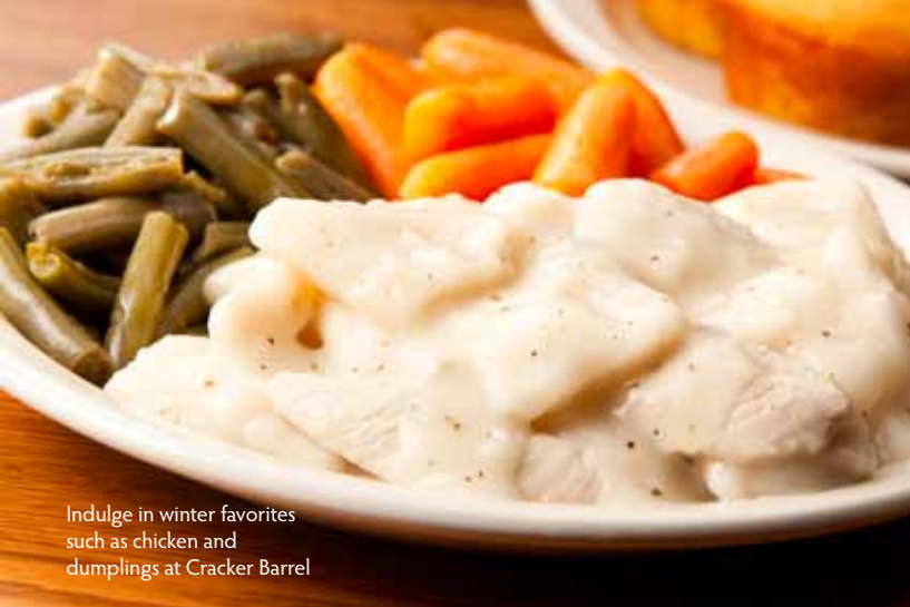
Indulge in winter favorites such as chicken and dumplings at Cracker Barrel