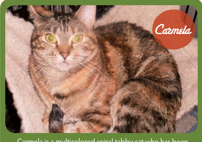
Carmela is a multicolored spiral tabby cat who has been waiting for her permanent home for two years. She is independent and loves the indoor life. Female, age 4.