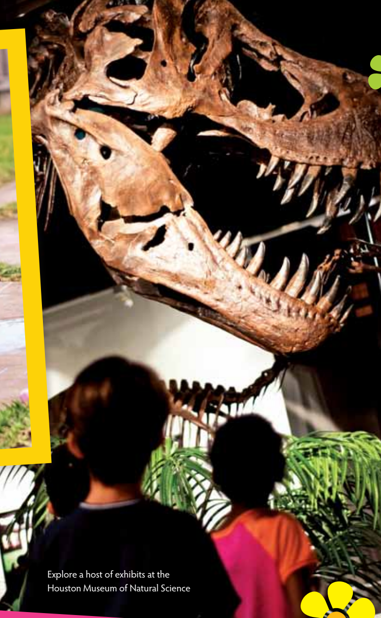
Explore a host of exhibits at the Houston Museum of Natural Science