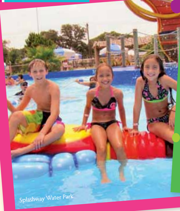
Splashway Water Park