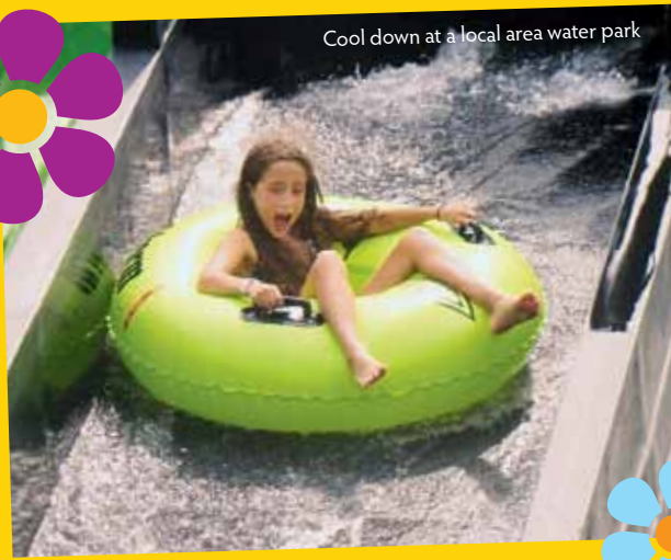
Cool down at a local area water park