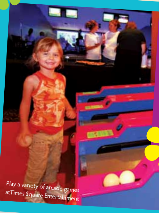
Play a variety of arcade games at Times Square Entertainment