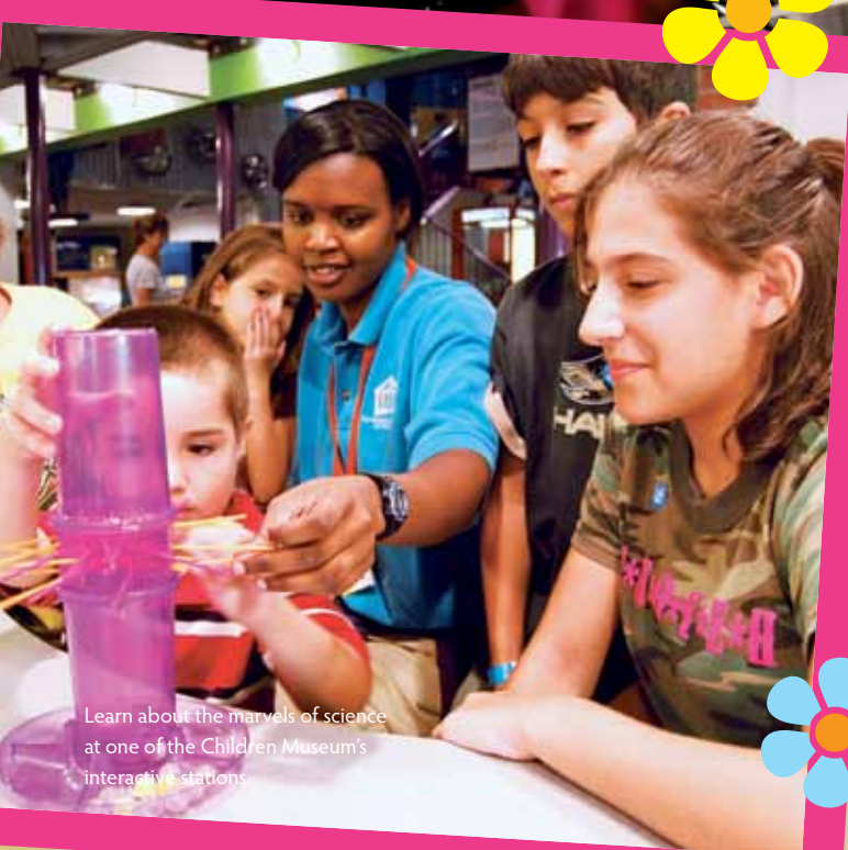
Learn about the marvels of science at one of the Children's Museum's interactive stations