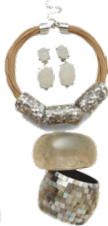
Metallic jewelry Chicos $20-49