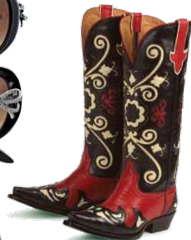
Margaret Red & Black Boots Texas National Outfitters $399