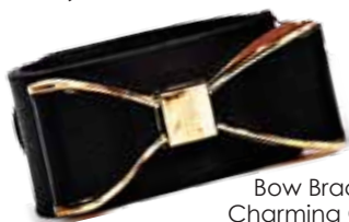
Bow Bracelet Charming Charlie $10

Dark denim and black accent pieces add drama and pizzazz to any wardrobe.