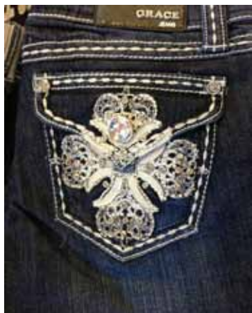
Grace Capris Beau Kisses $58