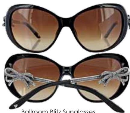
Ballroom Blitz Sunglasses Brighton $90