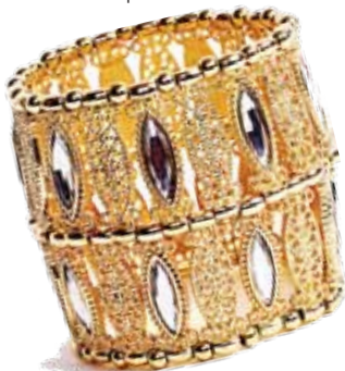
Gold Cuff Charming Charlie $13

From the red carpet to the carpool, you can expect to see women adorned with shimmering gold accents in all shades of gold this spring.