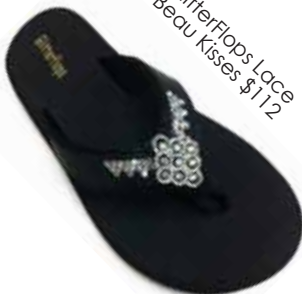
Glitterflops Lace Beau Kisses $112