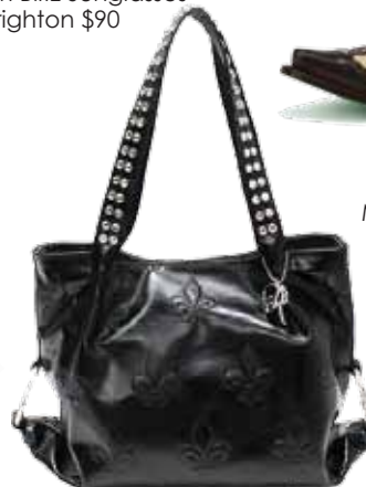
Raviani Handbag Beau Kisses $325