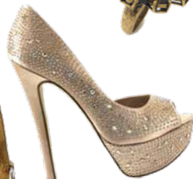
Showstopper Platform Pump Bakers $69