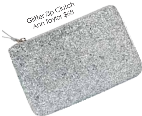
Glitter Zip Clutch Ann Taylor $68

For ultimate sparkle, try a burst or just a touch of silver this season.