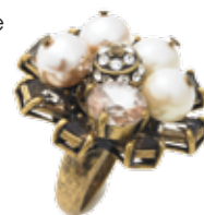
Faux Stone Rings Forever 21 $6-15