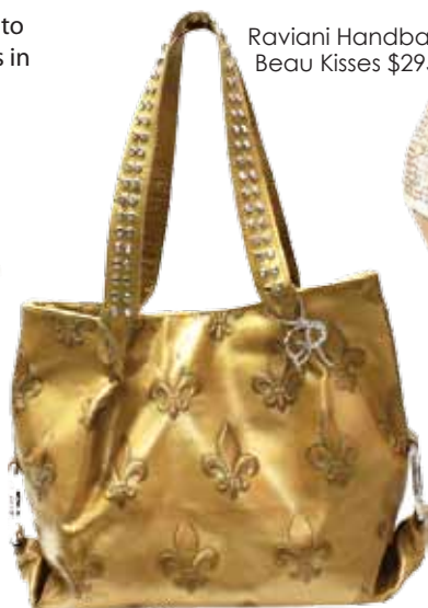
Raviani Handbag Beau Kisses $295