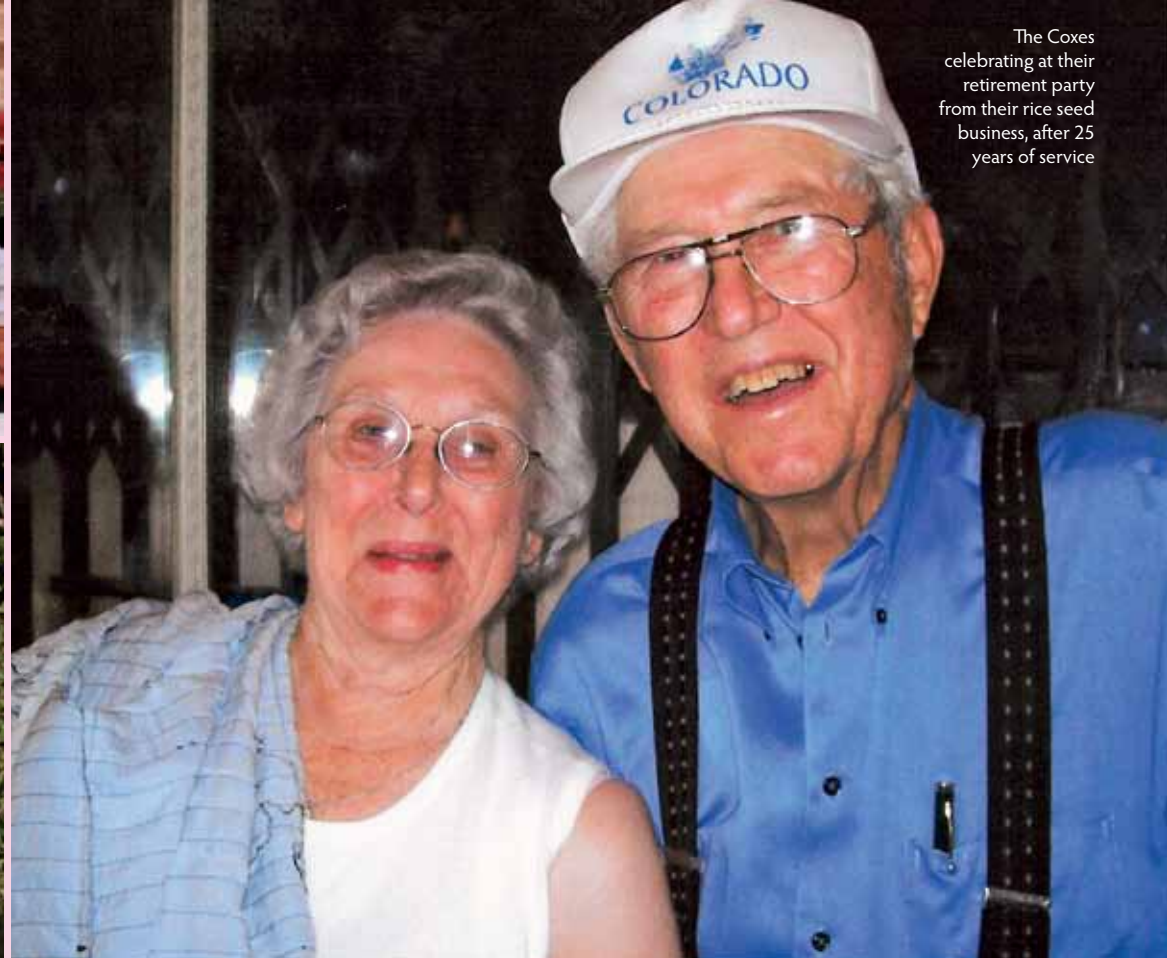
The Coxes celebrating at their retirement party from their rice seed business, after 25 years of service