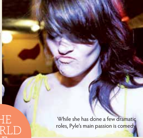
While she has done a few dramatic roles, Pyle's main passion is comedy