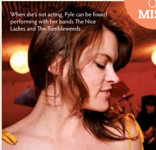
When she's not acting, Pyle can be found performing with her bands The Nice Ladies and The Tumbleweeds