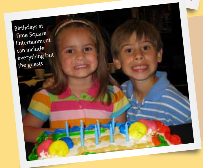
Birthdays at Time Square Entertainment can include everything but the guests