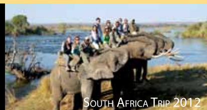
SOUTH AFRICA TRIP 2012