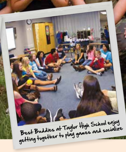
Best Buddies at Taylor High School enjoy getting together to play games and socialize