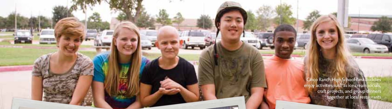
Cinco Ranch High School Best Buddies enjoy activities such as ice cream socials, craft projects, and group dinners together at local restaurants