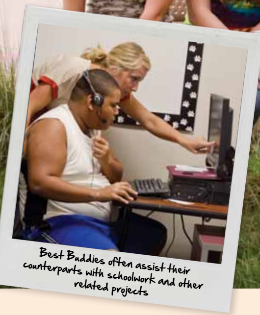
Best Buddies often assist their counterparts with schoolwork and other related projects