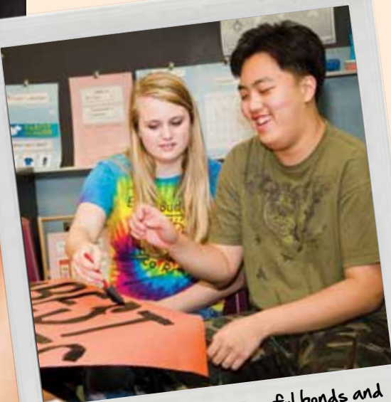
Best Buddies form powerful bonds and lasting friendships

The Katy community has been very accepting and cooperative with the special needs students and the Best Buddies program. The Katy Elks Club sponsors a Christmas party every year for Best Buddies from all six high schools as well as an end of the school year party. Restaurants accommodate the groups