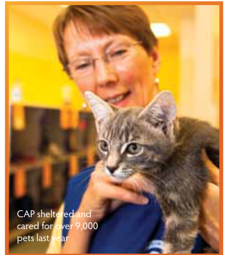
CAP sheltered and cared for over 9,000 pets last year