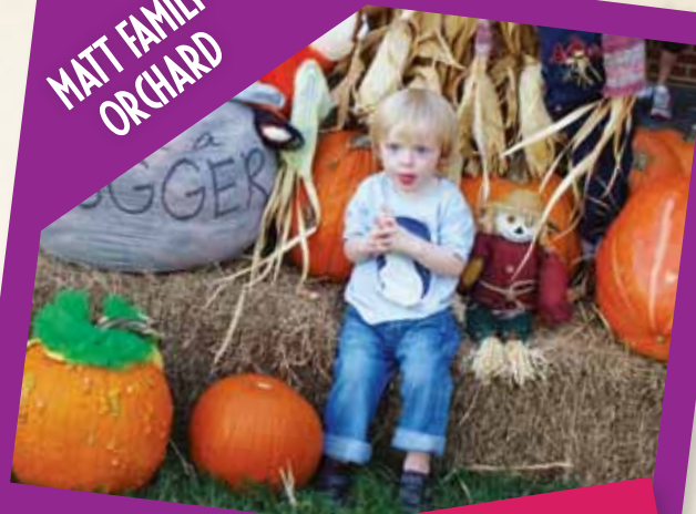
MATT FAMILY ORCHARD

Katyites ages 1 to 99 enjoy the fresh air and country atmosphere of Matt Family Orchard. Orchards of blueberries, figs, jujube, blueberries, and Asian persimmons are sprawled across 40 acres. Families can pick their own fruit, enjoy a picnic, take walks, or simply breathe in the fresh air. Children will also enjoy volleyball, tetherball, hay stacks, and a tire swing suspended 20 feet in the air. Personal tours are available and include camp fires, s'mores, hotdogs, and an educational hayride, as well as a pumpkin to take home.