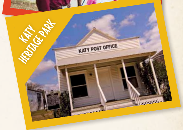
KATY HERITAGE PARK

With antique farming equipment, scores of photographs, and homes displayed as if they were frozen in time, Katy Heritage Park offers a unique glance into the area's history. Stately homes poised on beautifully landscaped grounds invite families to learn, picnic, and play. See their website for tour days and times, as well as information about scheduling special tours.