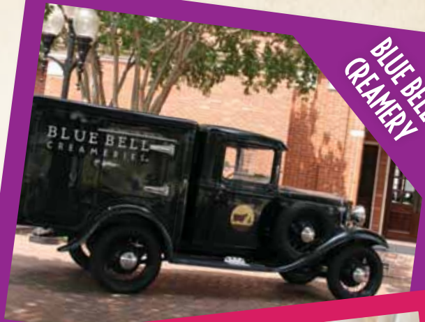
BLUE BELL CREAMERY

With programs for children of all age groups, the Houston Arboretum and Nature Center offers fun, free nature education in the heart of Houston. Explore amphibians, plants, reptiles, birds, mammals, and the habitats they live in. Have a ball at the ArBOOretum, where costumed participants hike the forest trails with scattered trick-or-treat locations.