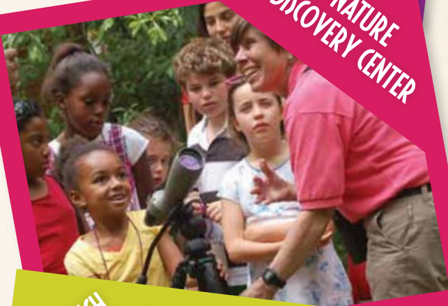
NATURE DISCOVERY CENTER

Are your cuties curious about creepy crawly things? Nature Discovery Center provides interactive exhibits featuring live animals free of charge. Catch a closer look at rabbits, quail, lizards, snakes, turtles, and more in a laid-back, comfortable, and safe environment. Begin the fun before you arrive with scavenger hunts, nature challenges, and other printable activities found on the center's website.