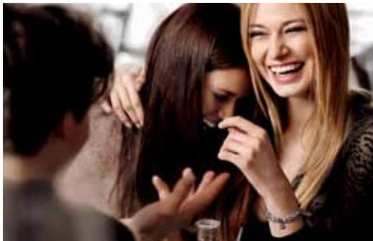
Sterling silver charms from $25