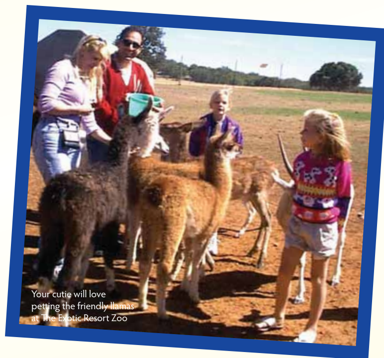
Your cutie will love petting the friendly llamas at The Exotic Resort Zoo

On the outskirts of San Marcos lies the hidden treasure of the Animal World and Snake Farm Zoo. The facility has dazzled generations of animal lovers for over 40 years. Have you ever seen a lemur paint? Visit Lizzie Lemur and several canvas-loving crocodiles at the animal art exhibit. Interact with over 500 animals at the petting zoo, or observe feeding time with exotic creatures like alligators and primates. Families can also attend a variety of exciting events at the zoo, including reptile, animal, and snake encounter shows each day. Check their online calendar to help you plan your trip.