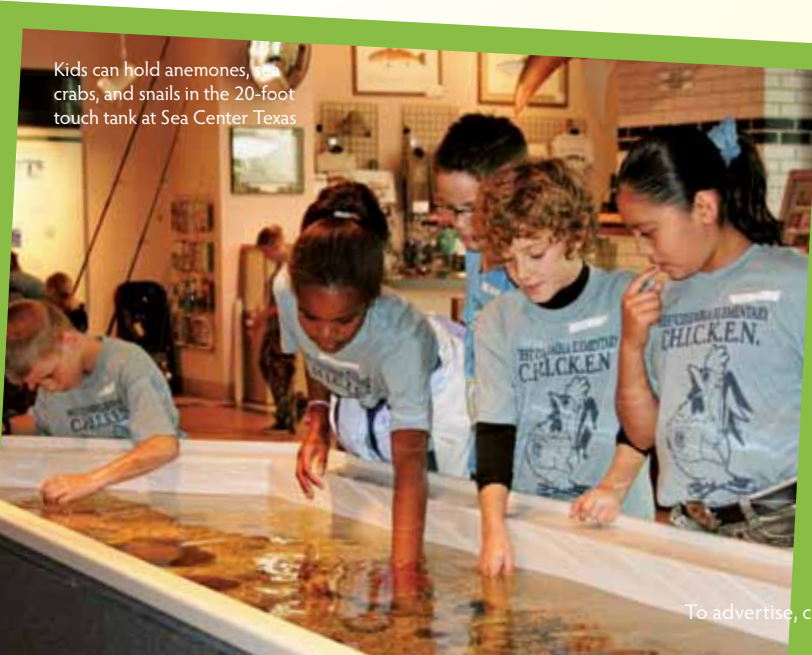
Kids can hold anemones, crabs, and snails in the 20-foot touch tank at Sea Center Texas

A favorite spot for many Katy families, Moody Gardens features a giant aquarium with thousands of marine animals from eels to penguins. For a tropical escape, journey through the Rainforest Pyramid and see butterflies, Brazilian rainbow boas, and cobalt blue tarantulas up close in the facility's many exhibits. As one of the world's most authentic rainforest habitats, the pyramid provides guests with a larger-than-life experience viewing over 1,000 species of exotic plants and animals. Families can also have lunch on the Colonel Paddlewheel Boat, treat their inner scientist at Discovery Museum, relax in the Palm Beach wave pool, or enjoy a unique film at the 4D Special FX Theater. There is certainly no shortage of entertainment and fun!