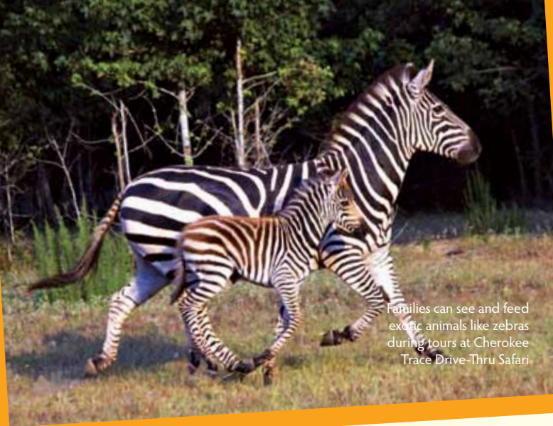
Families can see and feed exotic animals like zebras during tours at Cherokee Trace Drive-Thru Safari