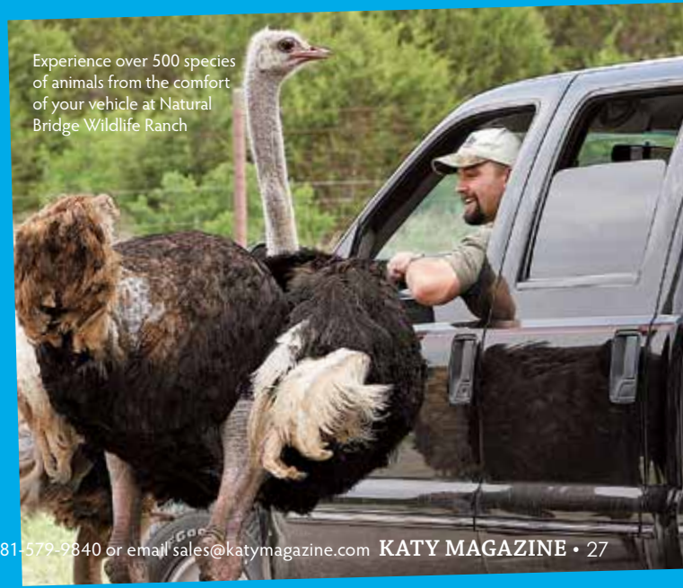
Experience over 500 species of animals from the comfort of your vehicle at Natural Bridge Wildlife Ranch