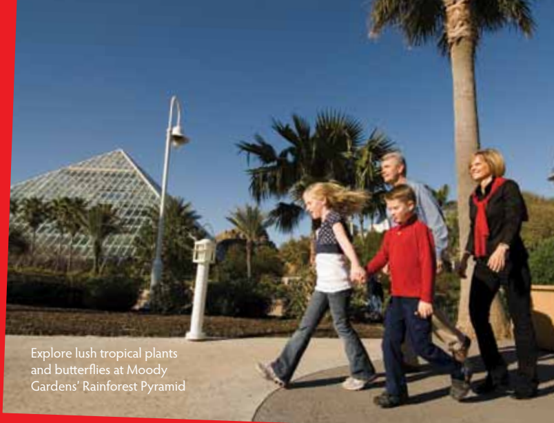
Explore lush tropical plants and butterflies at Moody Gardens' Rainforest Pyramid

Breakfast with a bison, tent-camping on the beach, relaxing in a hot tub as animals stroll past – whatever your family's flavor, these wild summer safaris have it all! With lots of spots within short driving distance of Katy, your family can embark on a new adventure, see amazing wildlife up close, and enjoy the great outdoors.