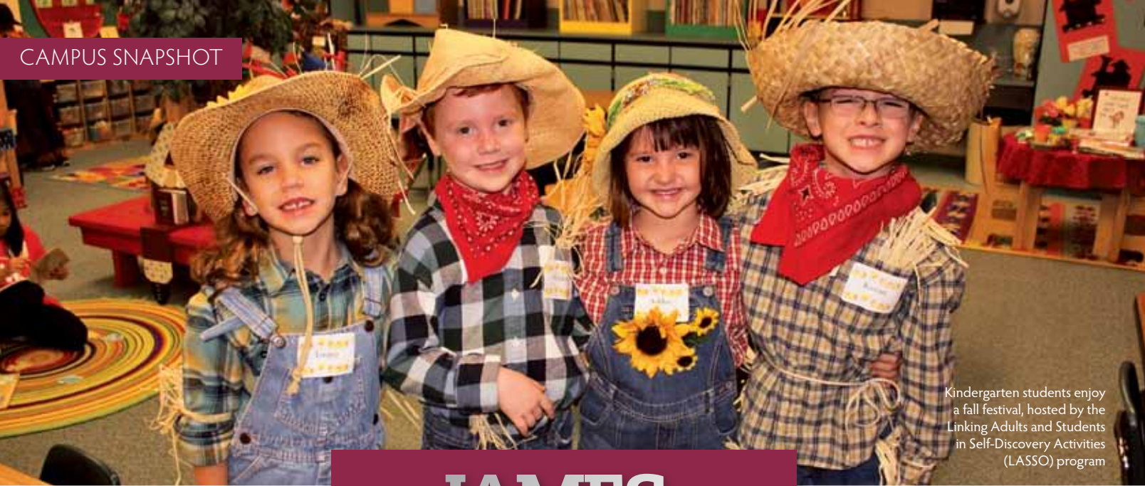
Kindergarten students enjoy a fall festival, hosted by the Linking Adults and Students in Self-Discovery Activities (LASSO) program