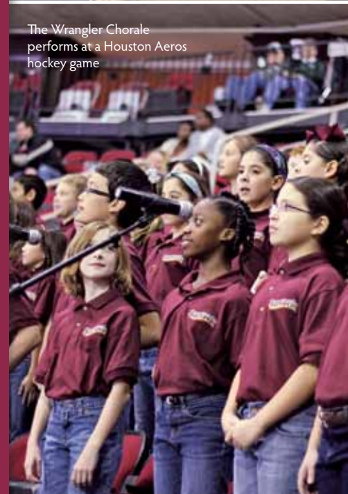
The Wrangler Chorale performs at a Houston Aeros hockey game