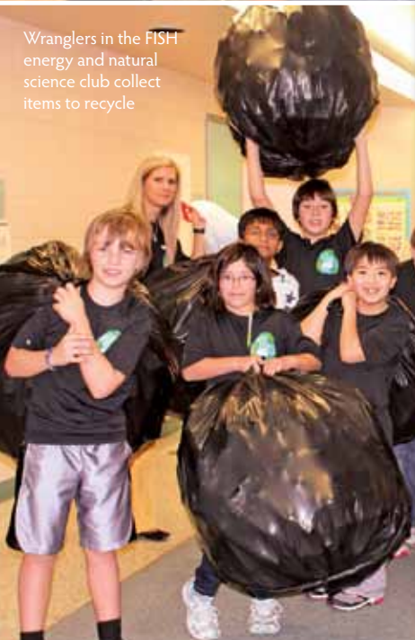
Wranglers in the FISH energy and natural science club collect items to recycle