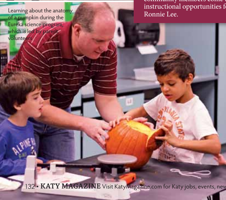
Learning about the anatomy of a pumpkin during the Eureka science program, which is led by parent volunteers