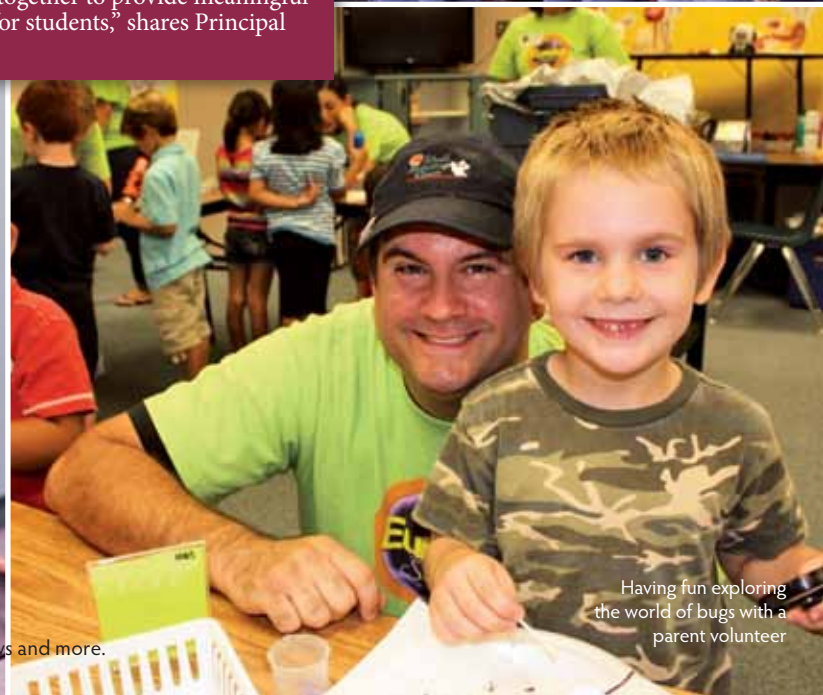
Having fun exploring the world of bugs with a parent volunteer