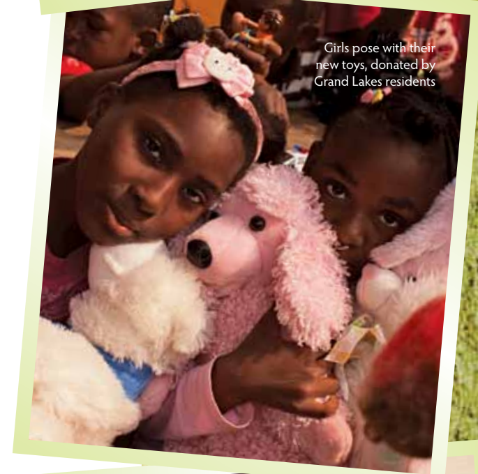
Girls pose with their new toys, donated by Grand Lakes residents