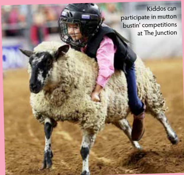
Kiddos can participate in mutton bustin' competitions at The Junction