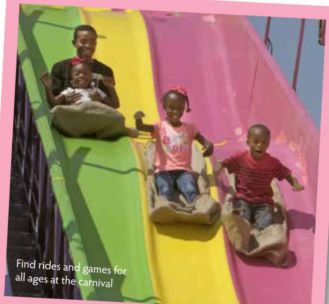
Find rides and games for all ages at the carnival