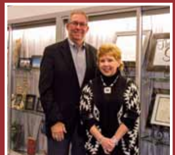
Exhibit of School Architecture Value Award

First-grade team and Fourth-grade team awarded grants from Katy ISD Education Foundation