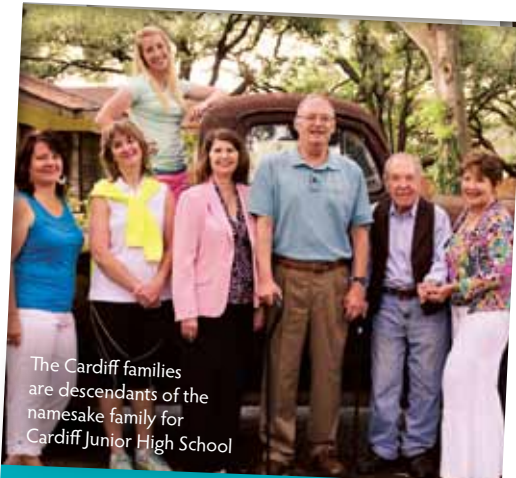
The Cardiff families are descendants of the namesake family for Cardiff Junior High School