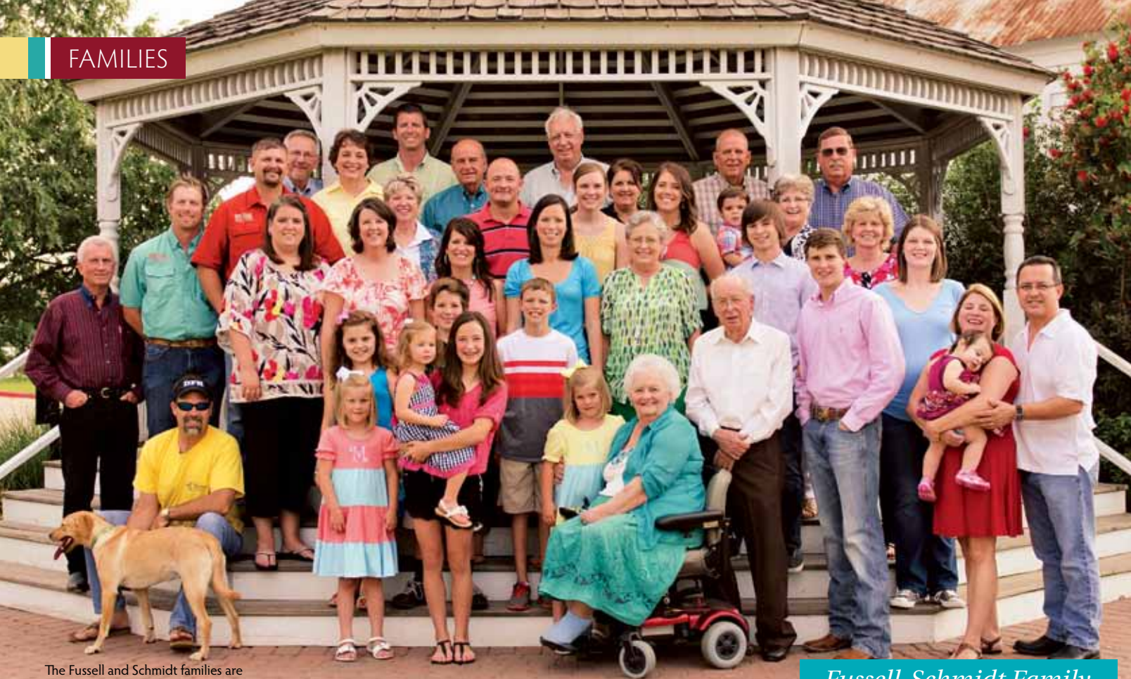
The Fussell and Schmidt families are founding members of Katy and many of their descendants still live in the area