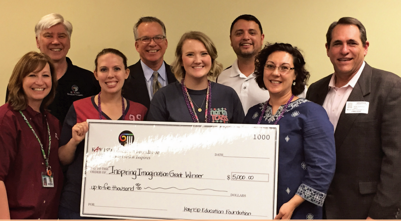
Mayde Creek Junior High winner is awarded a $5,000 grant