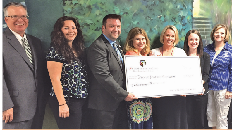
Nottingham Country Elementary teacher is granted up to $5,000 to complete her project