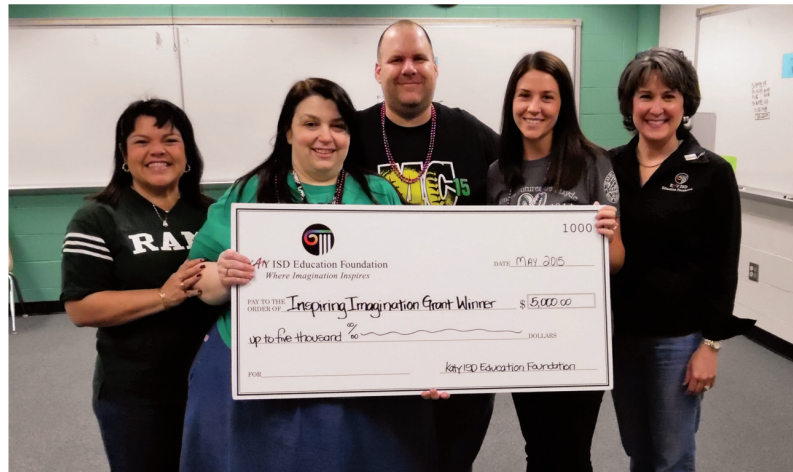
Mayde Creek High School is awarded a grant for their tutoring program, Tools of the Trade

Bright minds often inspire and encourage the creativity of others. Katy ISD Education Foundation's Inspiring Imagination grant program was established to help enrich classroom education for students through the inspiration and creativity of Katy ISD teachers. In the past three years, the Inspiring Inspiration grant program has distributed more than $550,000 in grant awards to Katy ISD teachers. In 2015, Inspiring Imagination awarded grants to 180 teachers and 30 campuses across Katy ISD.