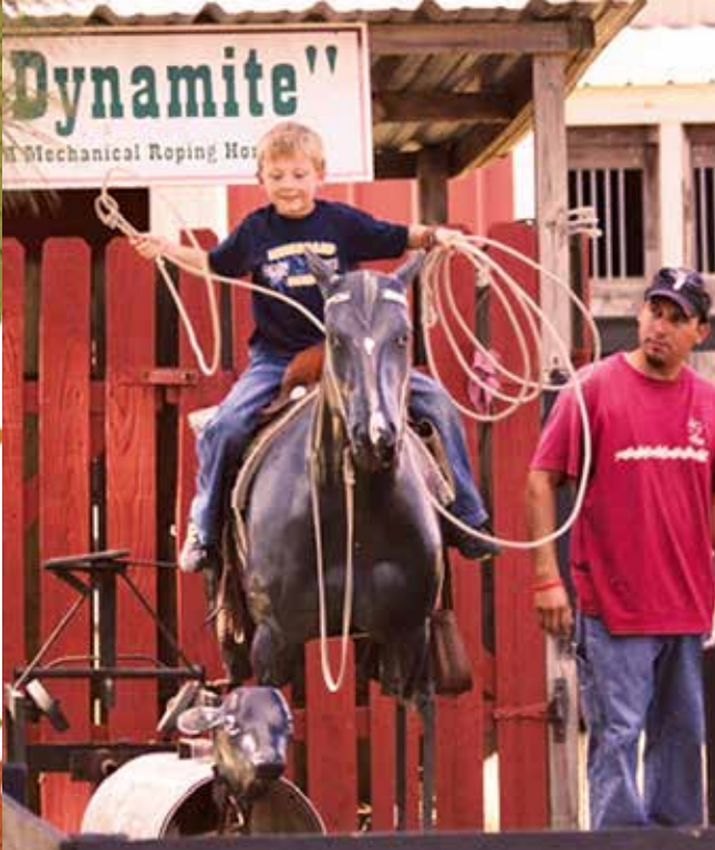
Children can enjoy activities at the Pumpkin Patch and Scarecrow Festival at the Oil Ranch