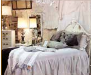
New Bedding & Vintage Linens