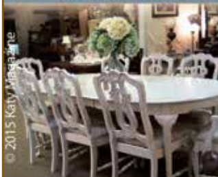
Furniture & Home Decor

ANTIQUES, VINTAGE FURNISHINGS, REPURPOSED ITEMS & MORE Come see our 12,000+ sf store full of merchandise!