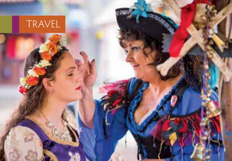
Face painting at Texas Renaissance Festival