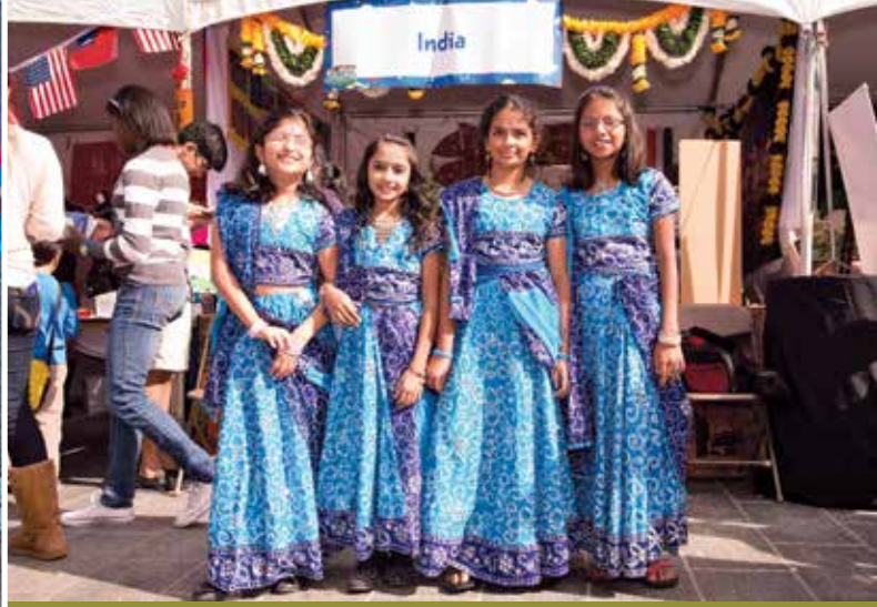
Indian culture booth at iFest Live

For a minimal donations, children will be able to create their own chalk paintings at Via Colori