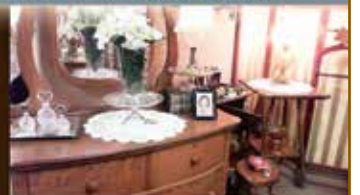
Eclectic Mix of Old & New