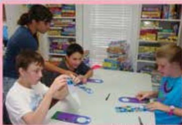
Premier Academy 8:30-3:30

Highly acclaimed therapy programs for children with special needs.