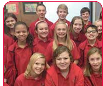
We love Westlake Prep!