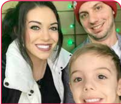
A fun family outing