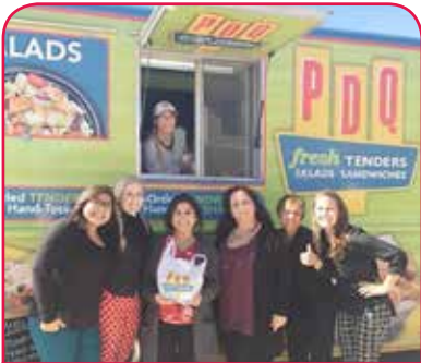
PDQ comes to Katy Magazine