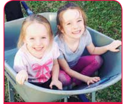
Girls just wanna have fun