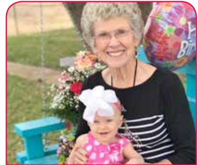
Celebrating Grandma's birthday