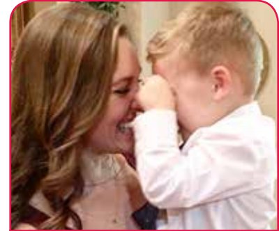
No more pictures, please!