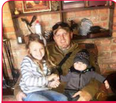
Keeping warm with dad