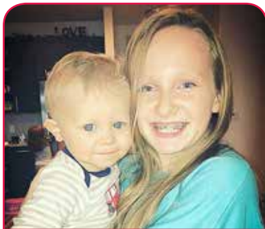
Too sweet for words