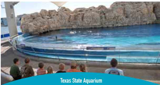
Texas State Aquarium

Resting in Corpus Christi Bay is the USS Lexington, which served as a carrier during World War II. Take a self-guided tour of the ship or visit the museum, virtual battle stations, or the 3D mega theater.