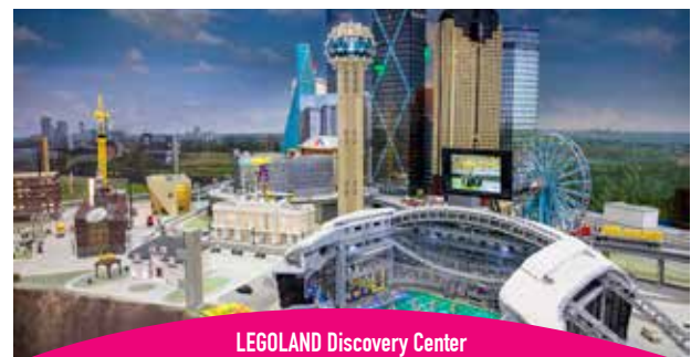
LEGOLAND Discovery Center

A LEGO lover's dream, this one-of-a-kind experience offers a LEGO factory tour, 4D cinema, and adventures like the Merlin's apprentice and kingdom quest rides. Visitors can also build and test their own LEGO car or explore the Star Wars miniland model display.