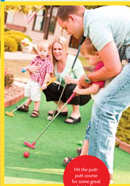
Hit the putt-putt course for some great family fun