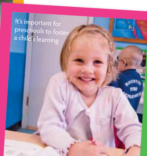
It's important for preschools to foster a child's learning