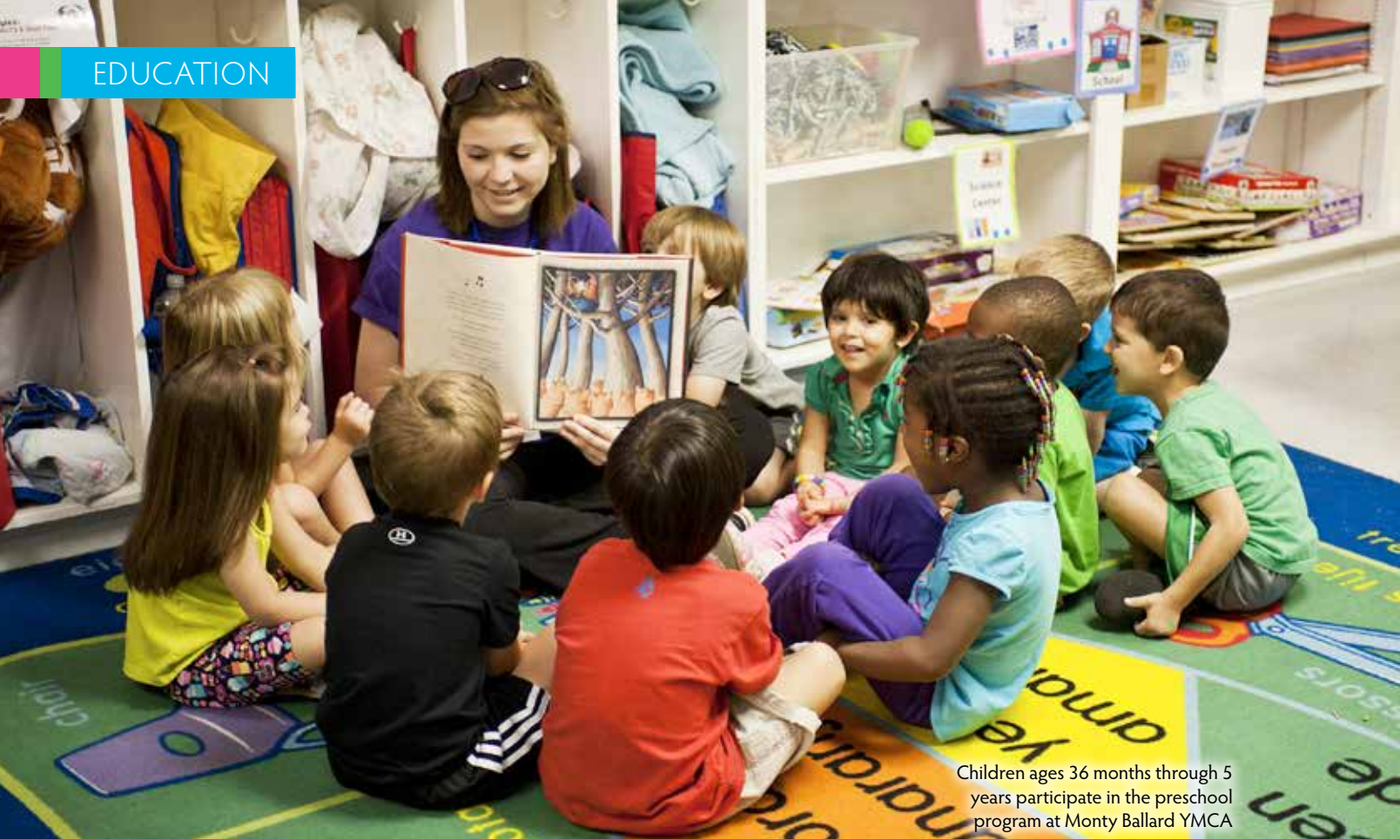
Children ages 36 months through 5 years participate in the preschool program at Monty Ballard YMCA