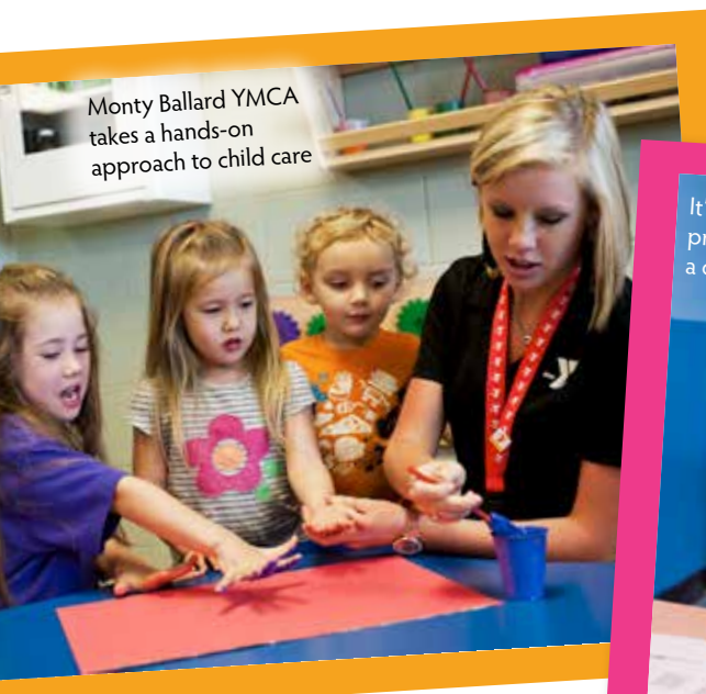
Monty Ballard YMCA takes a hands-on approach to child care