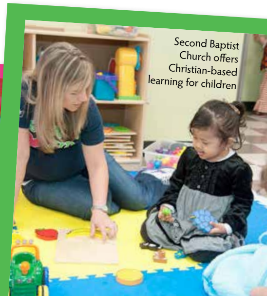
Second Baptist Church offers Christian-based learning for children