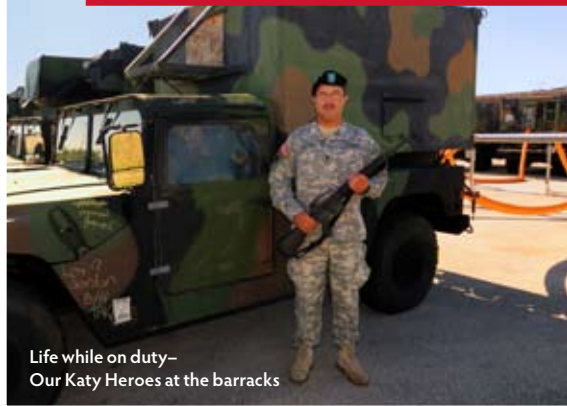
Life while on duty— Our Katy Heroes at the barracks