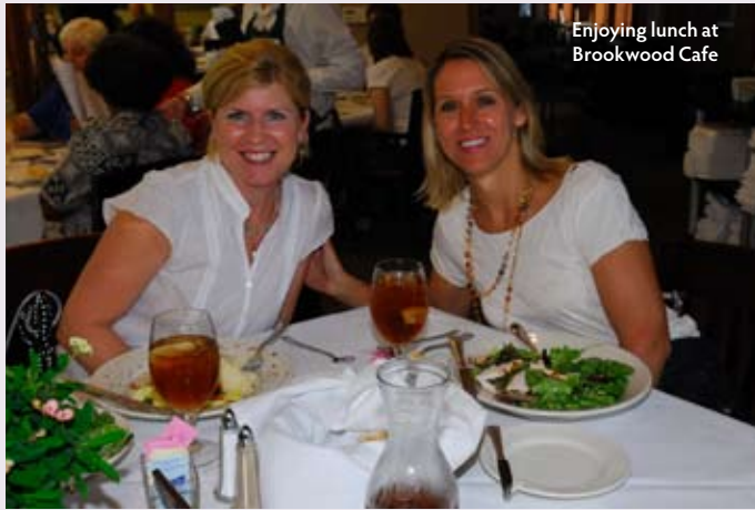
Enjoying lunch at Brookwood Cafe