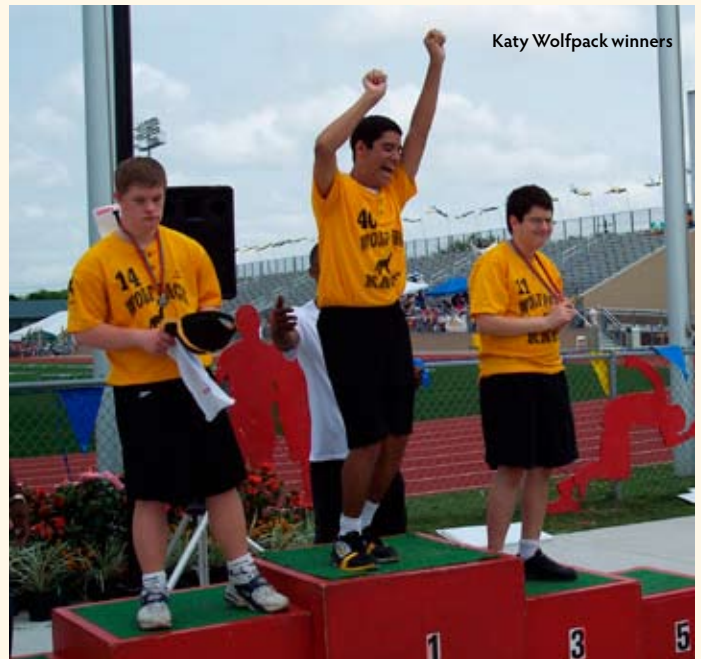
Katy Wolfpack winners