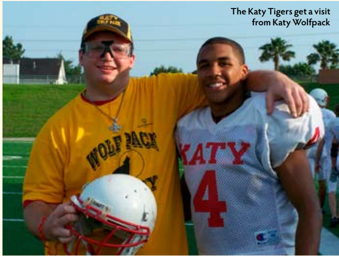
The Katy Tigers get a visit from Katy Wolfpack