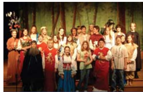
Knights' of the Rad Table, a spoof of the original, was put on by McMeans Junior High School students