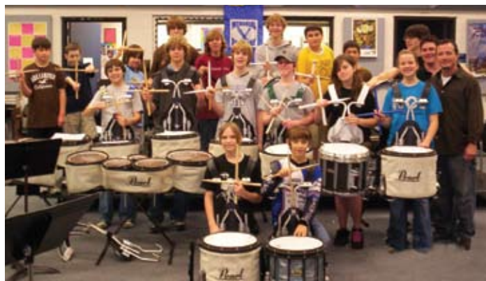
Memorial Parkway Junior High Band members recently formed their own drumline with the help of clinicians, N8Rhythm. The group will continue to perform at school events, starting with the upcoming Spring pep rally.