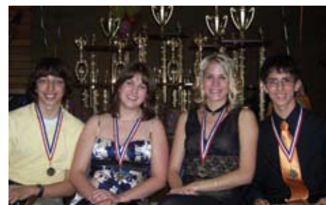
Katy ISD also provides approximately 2000 music students with supplementary weekly lessons. Pictured: Taylor HS choir students

“Students who want to be that involved or are involved in multiple activities will usually find a way. They may have to go to summer school, take online courses or correspondence courses to make room in their schedules for the higher level fine arts classes,” says Bryant. “Just in the last five or six years, the district has offered the possibility for those students who are engaged in the GPA race to take upper level fine arts courses as non-GPA courses. We don’t want to lose the straight-A student who has a lot of interest and ability,” says Bryant. One of the missions of Katy ISD is to prepare students to be successful citizens in a diverse and ever changing society. According to Bryant, fine arts programs facilitate that by emphasizing unique individual creativity in the various performance-based curriculums. KM