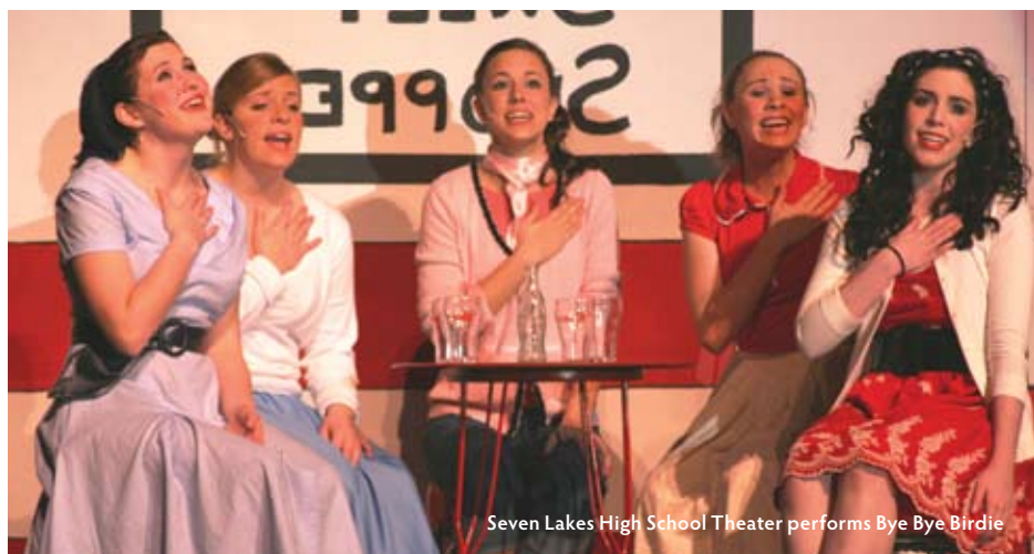
Seven Lakes High School Theater performs Bye Bye Birdie