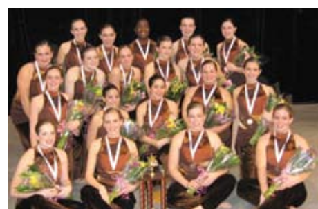
Taylor High School Winter Guard