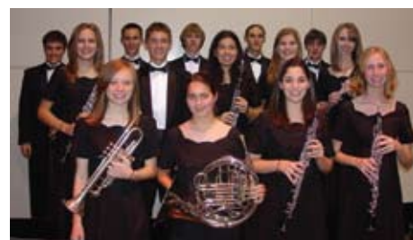
Katy ISD has some of the strongest Orchestras in the state.

The National Association for Music Education says the arts teach self-discipline, reinforce self worth, and advance the thinking skills and creativity valued in the workplace. They teach the importance of teamwork and cooperation. They demonstrate the direct connection between study, hard work and high levels of achievement. "For example, in a theatre arts curriculum, students not only read and analyze text, but they develop characters, design sets, lighting and costumes based on the text and the author's intent. In order to do this successfully, students need to stretch beyond