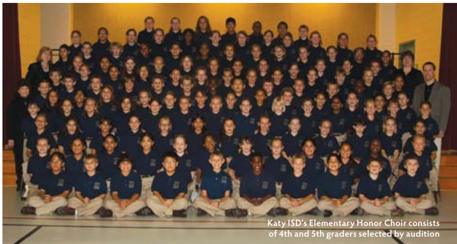
Katy ISD's Elementary Honor Choir consists of 4th and 5th graders selected by audition

basic application of concepts and move into higher order thinking skills of analysis and synthesis. In the design and building of sets, lights, and costumes, students are applying what they learn in physics, calculus, geometry and history. In an acting class,