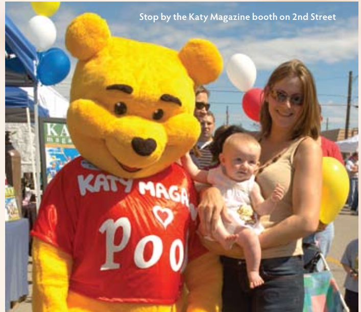
Stop by the Katy Magazine booth on 2nd Street

This family festival boasts three stages of continuous entertainment, craft and food booths, carnival attractions, rice cooking and photography contests, a pageant and a fun run. Call 281-391-5289 or visit katychamber.com .