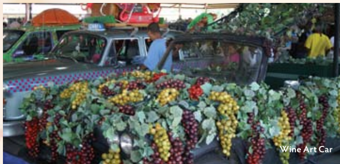
Wine Art Car

Bring the family and enjoy the sights of cars of all sorts transformed into original works of art. Meet the artists and enjoy live music all day. Free admission. Visit tradersvillage.com .