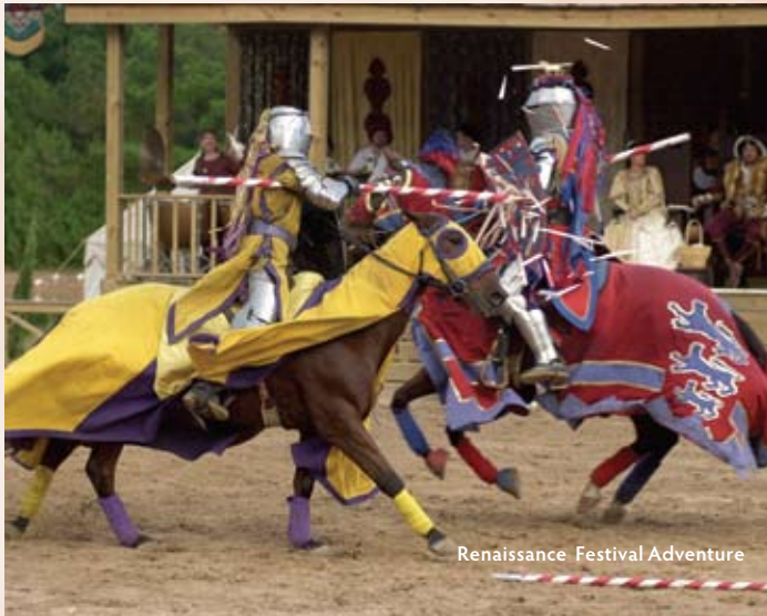
Renaissance Festival Adventure