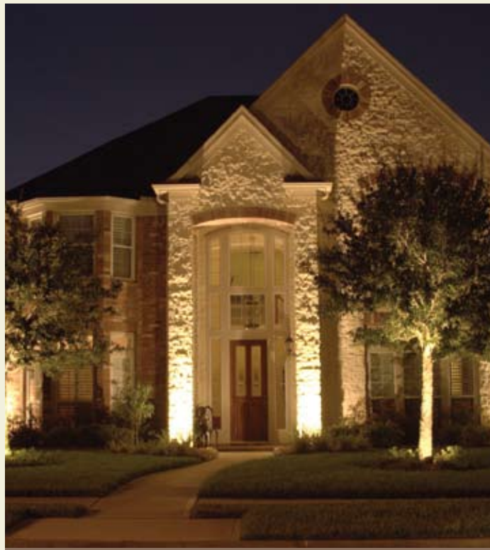
This Katy homeowner uses lighting to accentuate the trees and light up the doorway

Experts also suggest taking time to tidy up the front path on a regular basis. Sweep away all of the dirt, leaves, debris, and soggy newspapers that somehow find their way to your walkway and yard. Keep those garbage cans out of sight when garbage day is over. And what about that neon green hose that's sprawled out over the grass? It's time to roll it up and put it by the side of the house, preferably behind some shrubs. Don't let tools, gadgets and lawn ornaments affect your home's natural beauty. "Too much going on in the yard starts to detract from the house," says Fontenot. "Keep it light and neat."