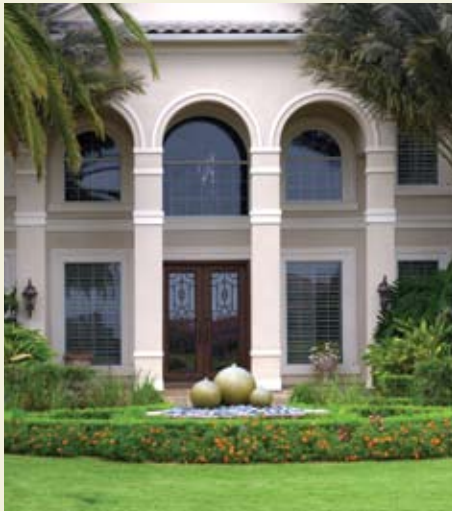
A unique tri-fountain is the focal point of this Katy homeowner’s front yard