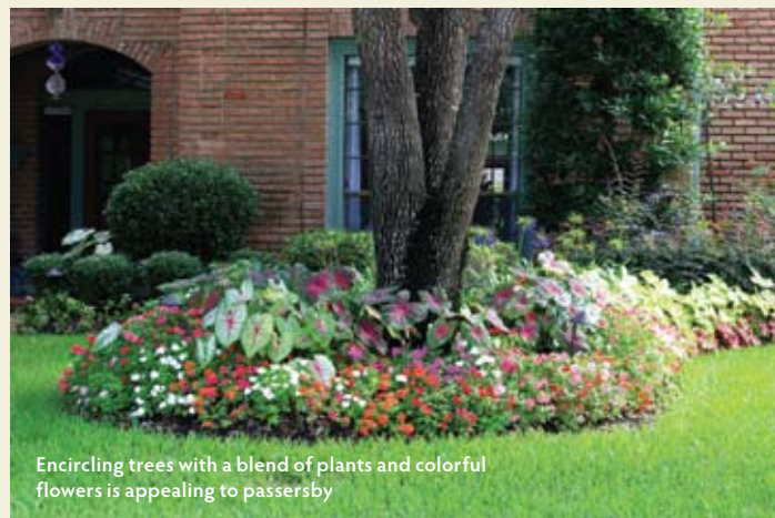
Encircling trees with a blend of plants and colorful flowers is appealing to passersby

"Nice landscaping, manicured lawn, gardens with mulch— everything nicely trimmed away from the house is really important."