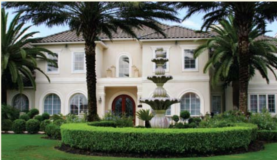
Palm trees, trimmed shrubs, and a fountain add elegance to this Katy homeowner's front yard

With every action there is a reaction, and in this, case curb appeal brings many. Not only will you start hearing compliments from your Katy neighbors, but you might see many of them following suit and jazzing