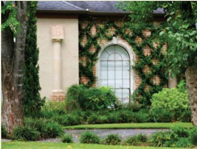
This Katy homeowner uses vines in a diamond pattern to enhance their homes exterior appearance