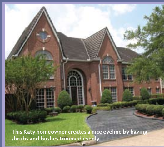
This Katy homeowner creates a nice eyeline by having shrubs and bushes trimmed evenly.