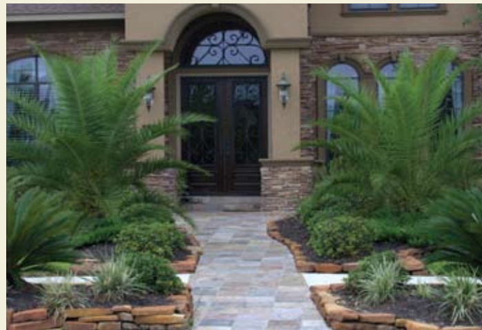
The elegant stone walkway is flanked by shrubs that are trimmed and well-maintained at this Katy home