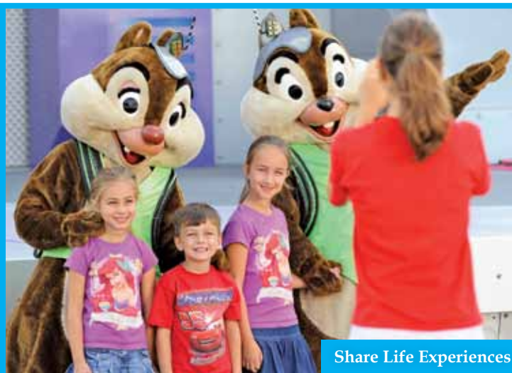
Share Life Experiences