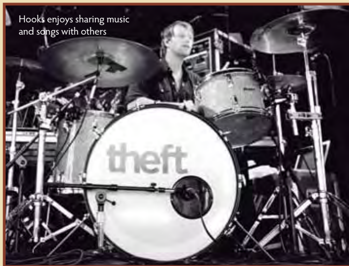
Hooks enjoys sharing music and songs with others