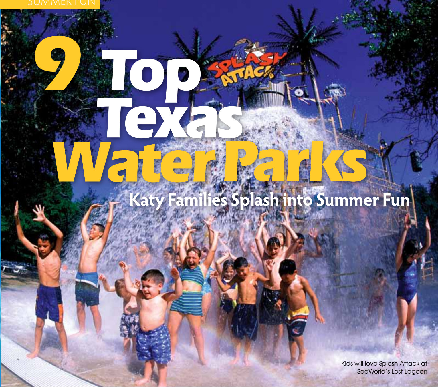
Kids will love Splash Attack at SeaWorld's Lost Lagoon