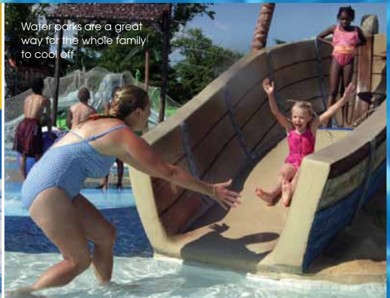
Water parks are a great way for the whole family to cool off

Looking for a way to cool off this summer while making a splash with the kids? In Texas, Katy families can find a wide variety of water parks full of fun for all ages. Here is a snapshot of 10 terrific water parks in the lone star state perfect for summertime getaways that both you and your Katy cuties will love. So, grab your swimsuit, sunscreen, and sense of adventure, and make some memories!