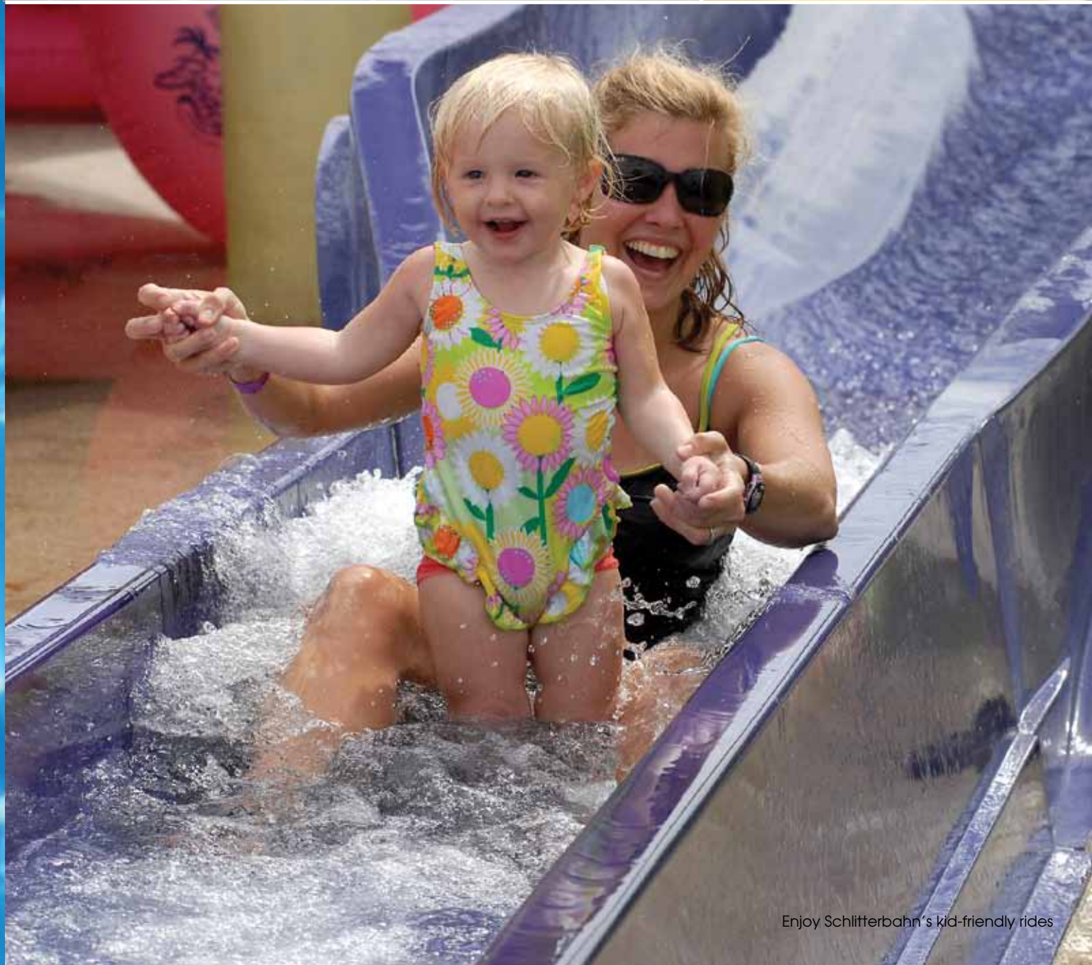
Enjoy Schlitterbahn's kid-friendly rides