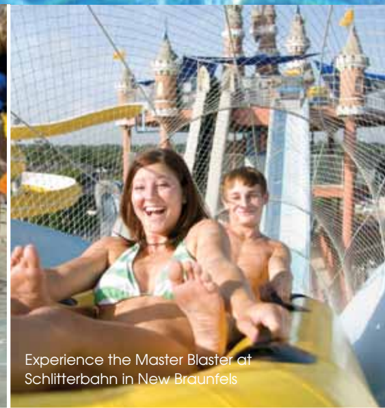
Experience the Master Blaster at Schlitterbahn in New Braunfels