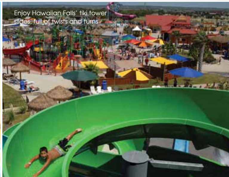
Enjoy Hawaiian Falls' tiki tower slides, full of twists and turns