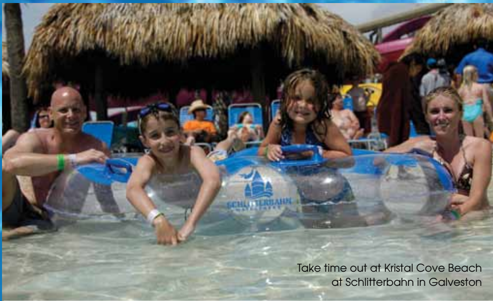
Take time out at Kristal Cove Beach at Schlitterbahn in Galveston