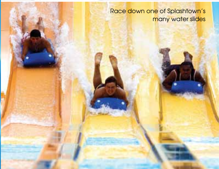
Race down one of Splashtown's many water slides