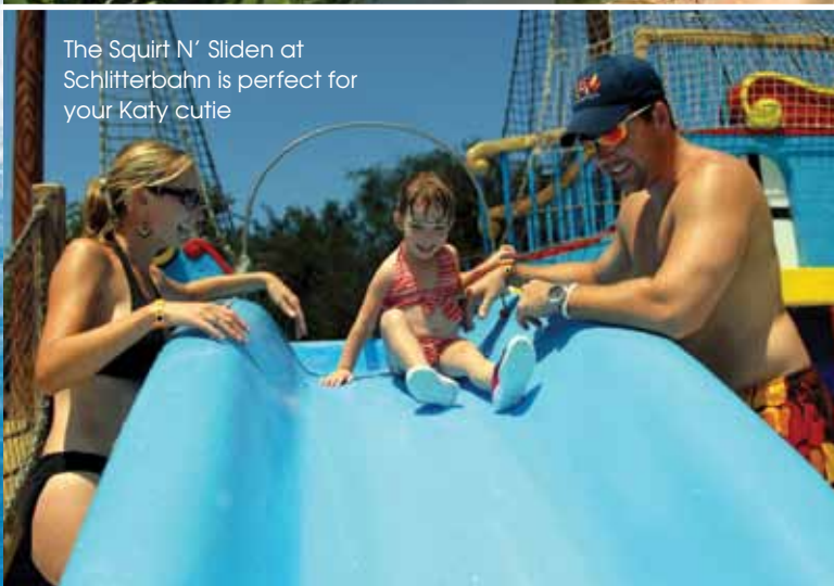
The Squirt N' Sliden at Schlitterbahn is perfect for your Katy cutie