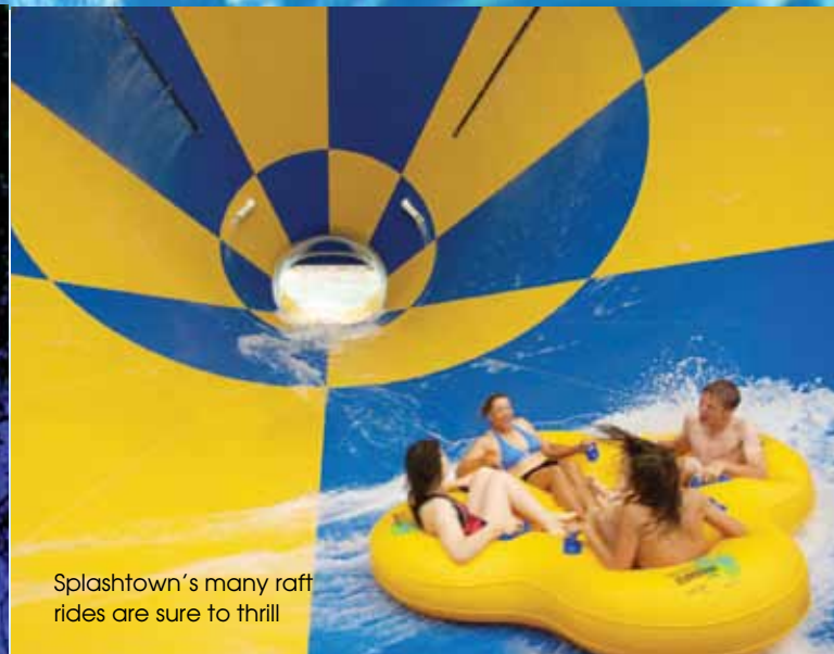
Splashtown's many raft rides are sure to thrill