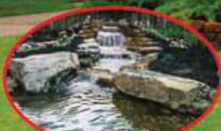
Ponds, Fountains, Water Falls