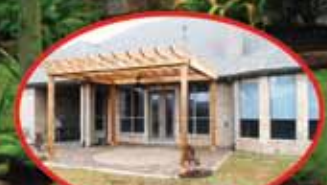
Patio Covers and Pergolas

Call today for a free estimate and give your property the 'Personal Touch' it deserves