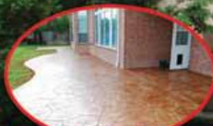
Pavers, Flagstone & Concrete

If you can imagine it, we can design and install it for you