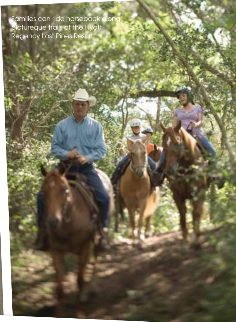
Families can ride horseback along pictureque trails at the Hyatt Regency Lost Pines Resort