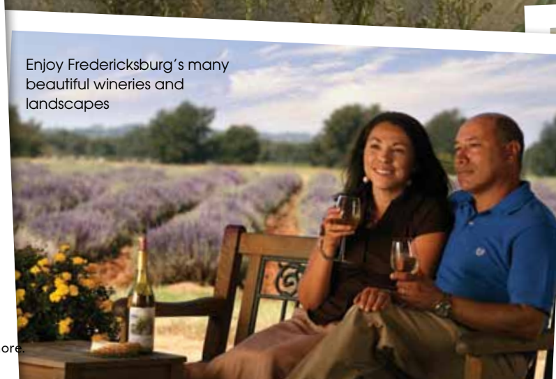
Enjoy Fredericksburg's many beautiful wineries and landscapes