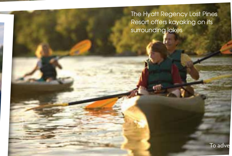
The Hyatt Regency Lost Pines Resort offers kayaking on its surrounding lakes