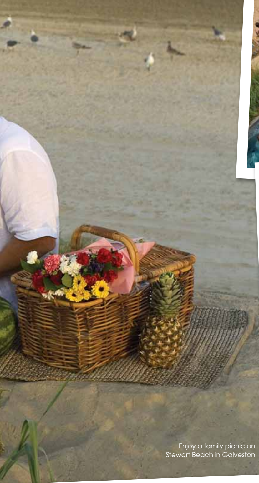
Enjoy a family picnic on Stewart Beach in Galveston