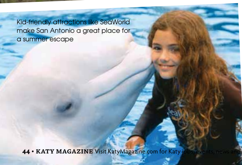
Kid-friendly attractions like SeaWorld make San Antonio a great place for a summer escape