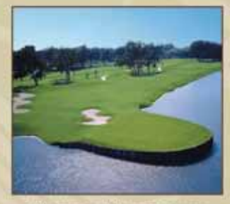
Championship golf course