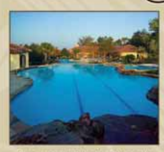
Two resort-style family pools