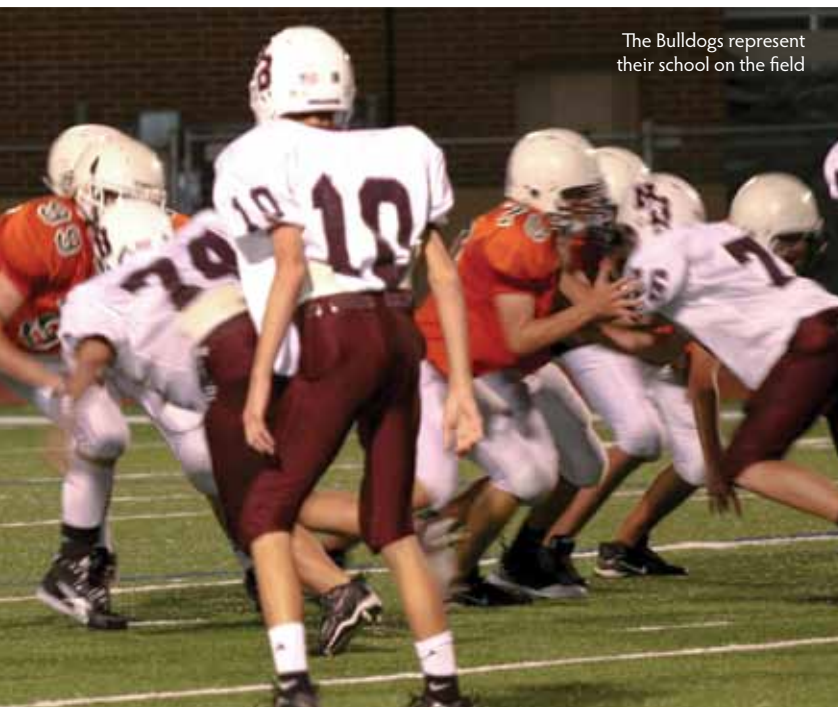
The Bulldogs represent their school on the field