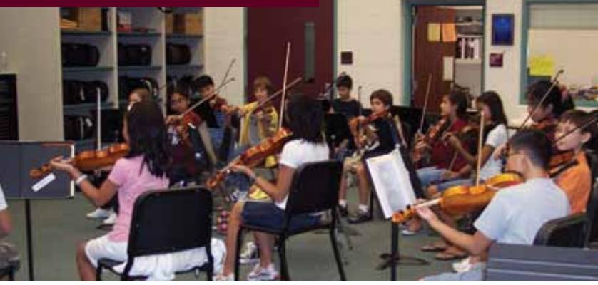
The Beck Junior High orchestra rehearses for a concert